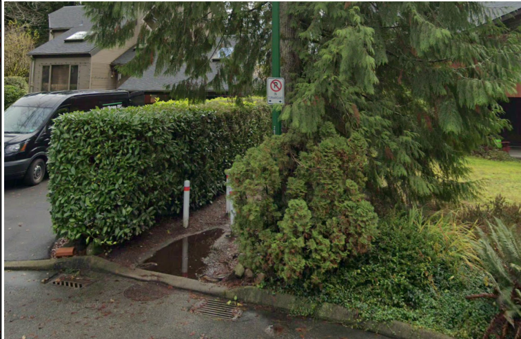
#1 - Trail head off McNair Place between #4645 & #4638.