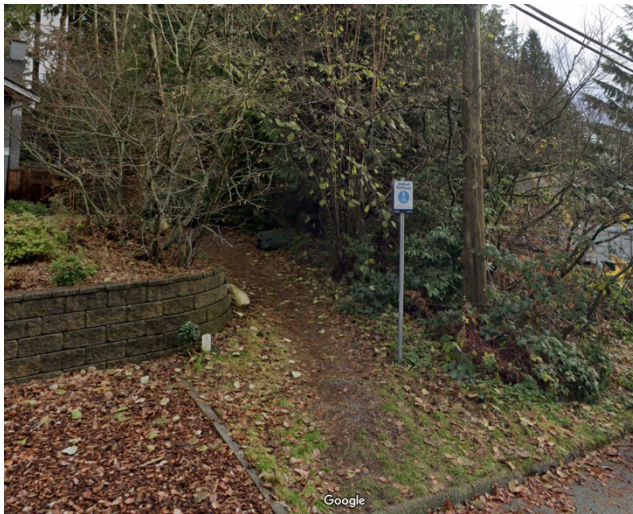
#2 - Trail head on Ramsay, between #4604 & #4592.

Please reach out if you have any questions or want to share ideas on how we can reduce traffic in front of the school and make it safer for everyone!