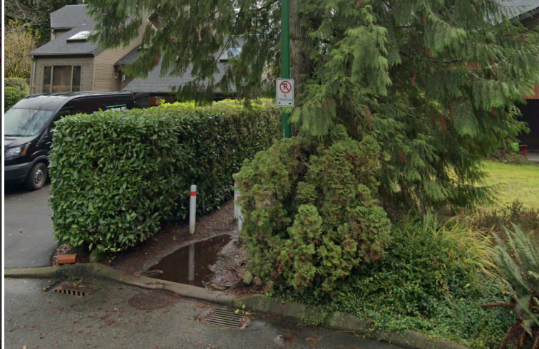
#1 - Trail head off McNair Place between #4645 & #4638.