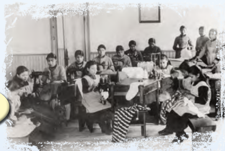
Girls in sewing class at the Fort Resolution Indian Residential School in the Northwest Territories.

When children were taken from their homes, it had a huge impact on communities. Parents and grandparents were sad and lonely without any children around, and the whole circle of life was broken.