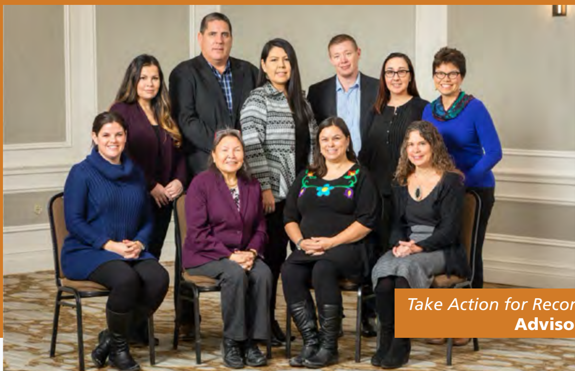
Take Action for Reconciliation Advisory Team