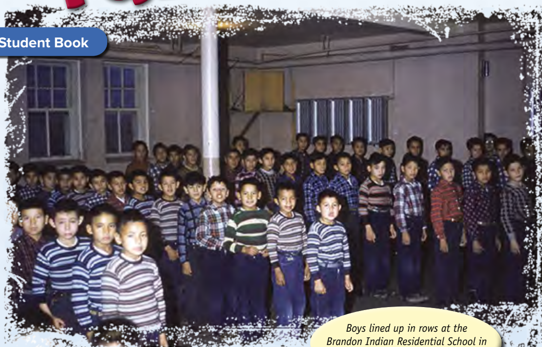
Boys lined up in rows at the Brandon Indian Residential School in Brandon, Manitoba, in 1960.