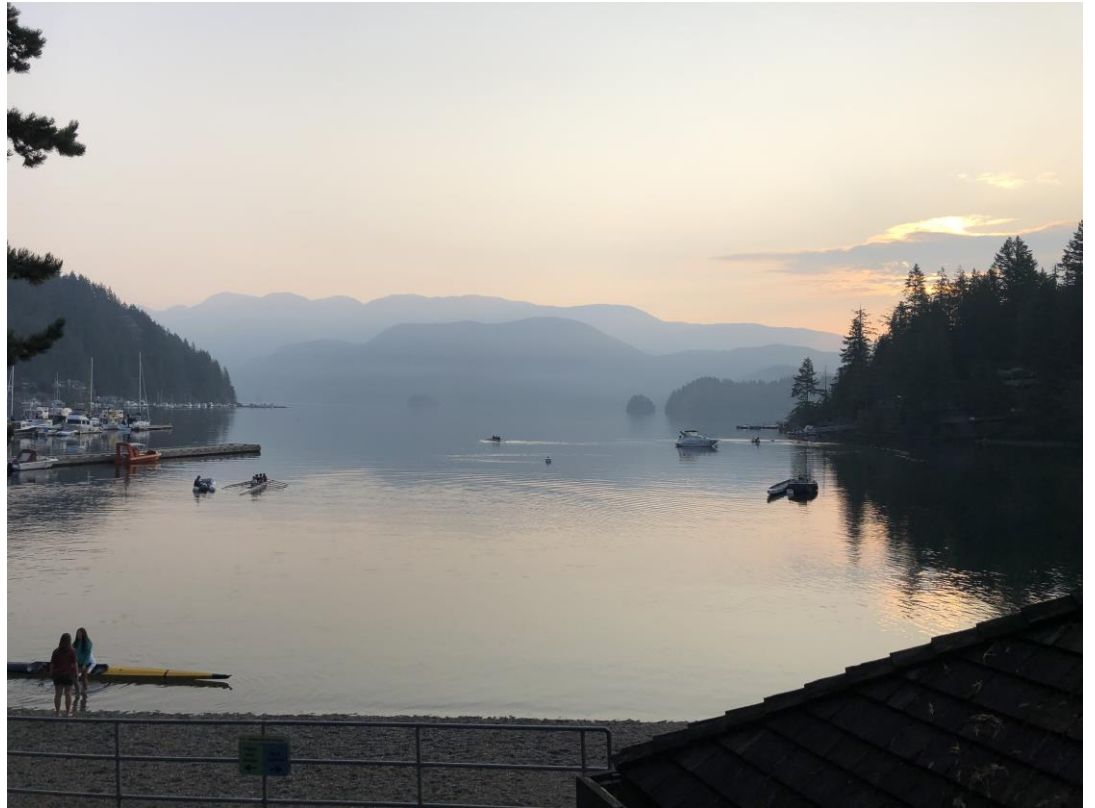
Rowing Academy – First Day on the Water