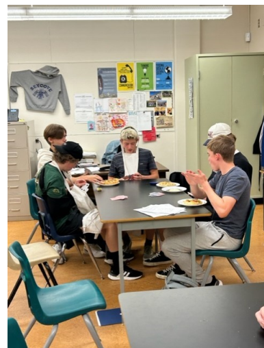
Foods 11/12 students enjoying freshly baked Focaccia and a game of cards.