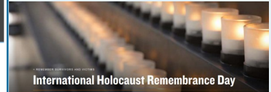
International Holocaust Remembrance Day

Click here for course programming information. Parents of incoming grade 8's please click here for information on the January 25th programming meeting.