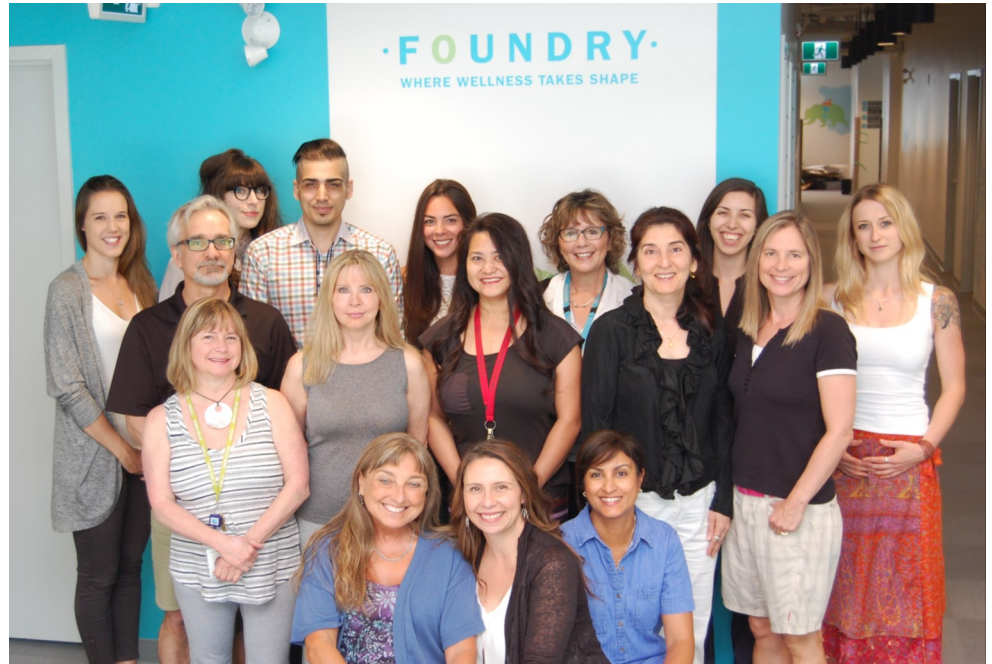
VCH’s Child Youth Mental Health & Substance Use staff in their new home at Foundry.