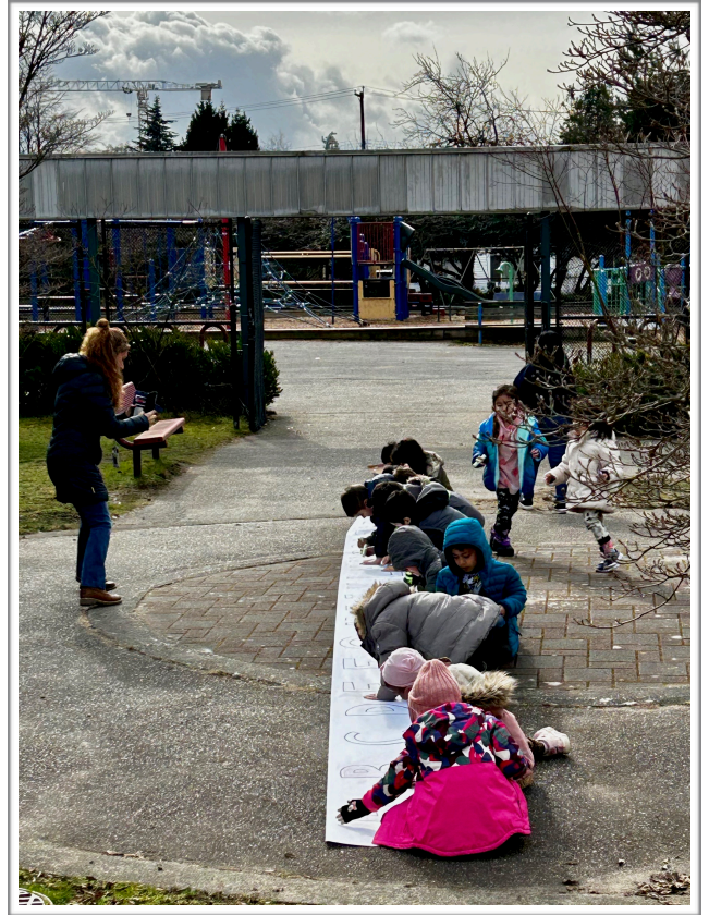
Balanced Communicators: The Kindies got outside to share their knowledge of the letters of the alphabet in the fresh air.