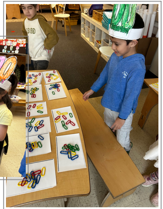
Thinkers & Communicators - The Kindergarten students celebrated their 100th day of school today! During the day they showed their understanding of how many 100 is by bringing and grouping 100 items as well as engaging in many activities to mark this special day. Congrats, Kindies on your 100th day!