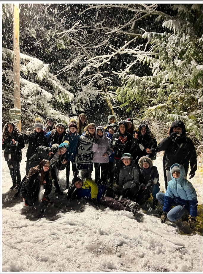
Balanced & Principled: The Grade 6s got out in the snow at Outdoor School! Staff members shared they were impressed with our students' enthusiasm and behaviour - way to go Gr. 6s!