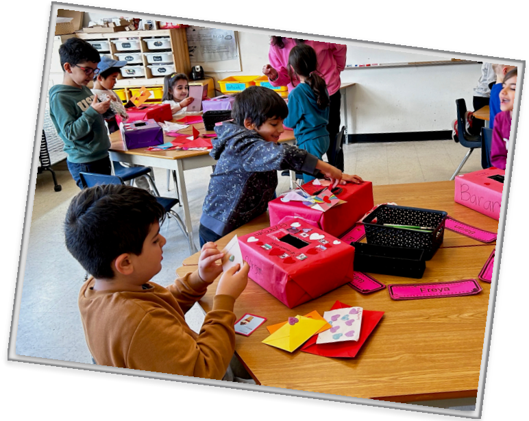
Caring: Students in all classes shared their appreciation and care for one another on Valentines Day!