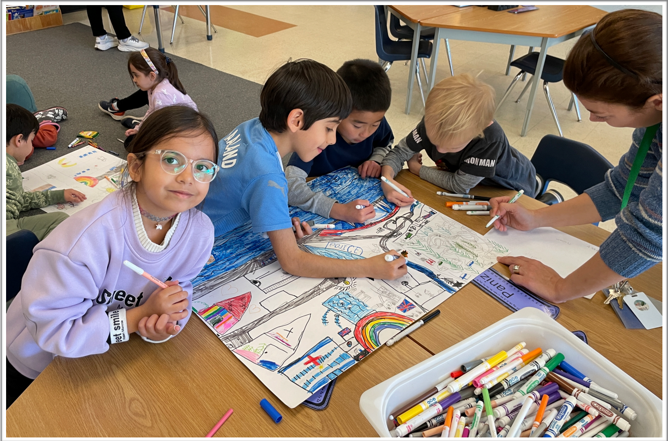
Grade 2 students collaboratively created communities as part of their How We Organize Ourselves unit of inquiry.