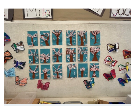
F12 - Davidson