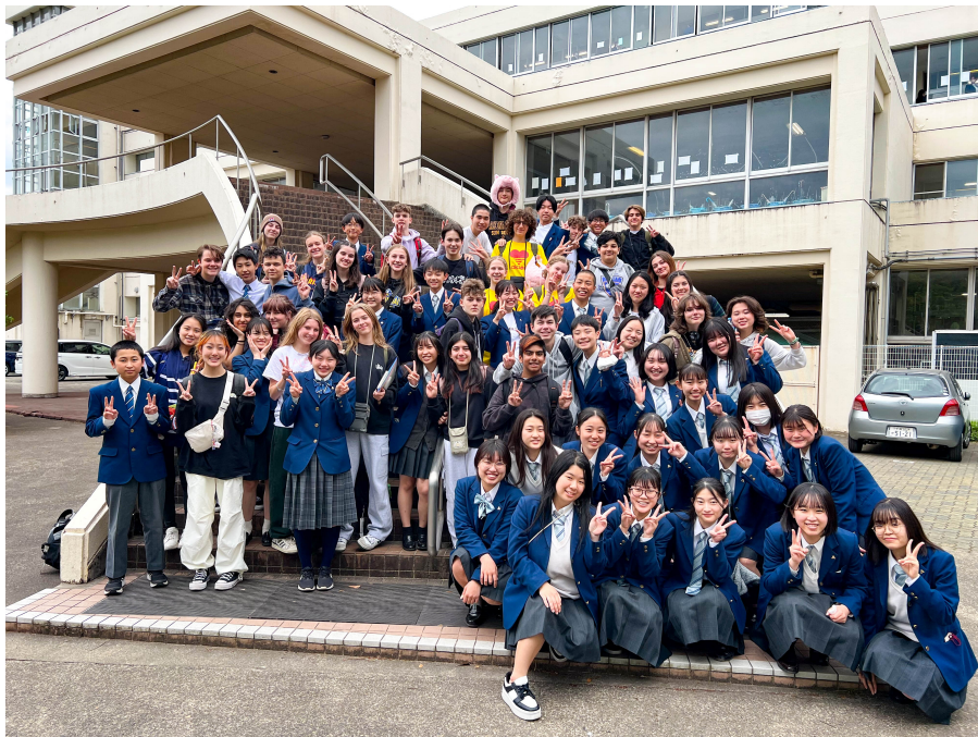
Group photo from the 2022-23 Trip

Follow their adventures on the trip blog at https://handsworthjapan2024.wordpress.com