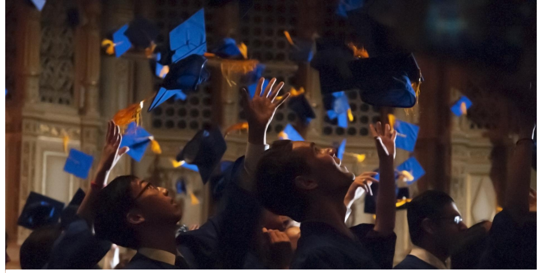
GRAD is taking place in less FIVE weeks!