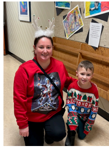
Dressed in festive clothes for the season