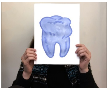
Example of photograph taken holding one of the 6" x 6" personal symbols created in Lesson #2.