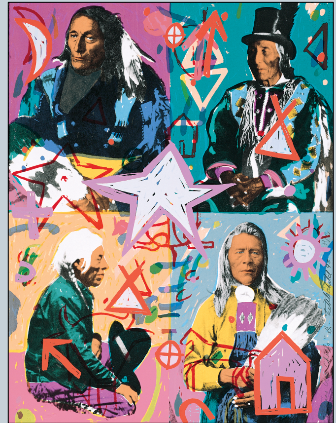
George Littlechild, Plains Cree Chief , 1996, 17 colour serigraph, 29 x 22.5 inches.

colours, strong shapes, photographs, and unusual collage elements, reflects a highly individual style and interpretation of his ancestry. He documents not only the struggles of Indigenous peoples but his own experience as a person of mixed race. His work is ideally suited to initiate students into an exploration and artistic interpretation of their own identities, cultures, and communities.