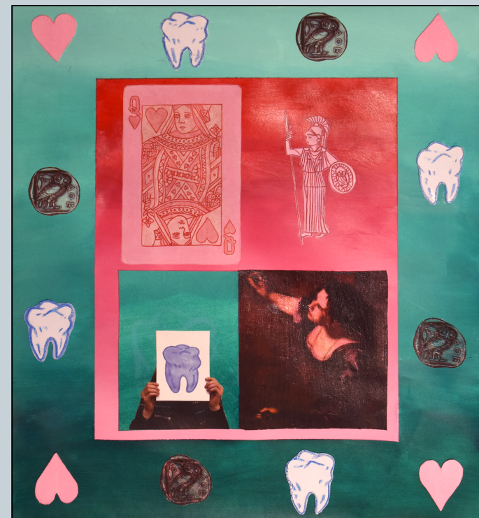
Teacher sample of finished collage.