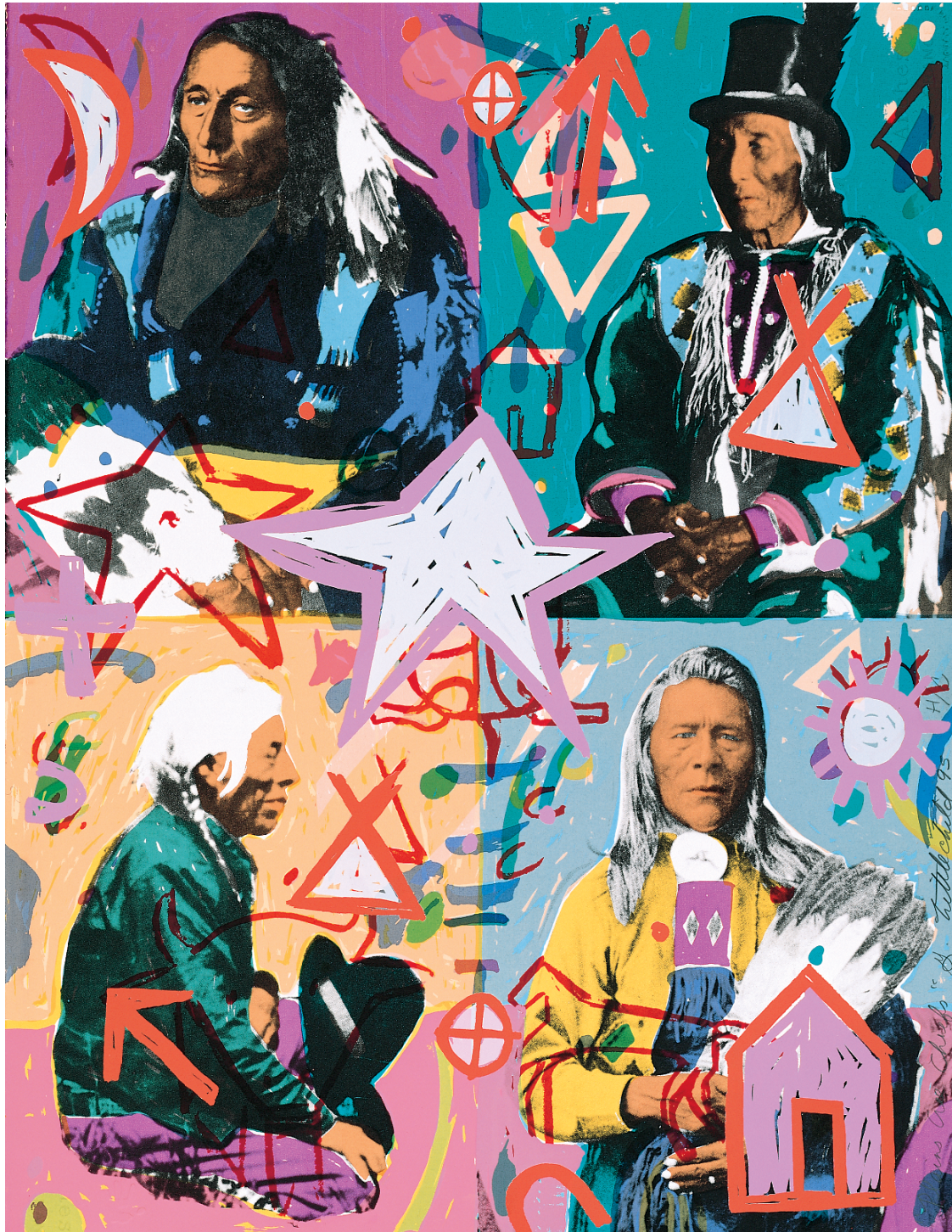
George Littlechild, Plains Cree Chief , 1996, 17 colour serigraph, 29 x 22.5 inches.