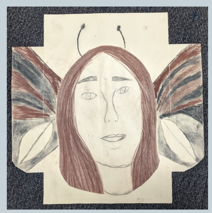
Artwork by Grade 7 Student, Cleveland Elementary