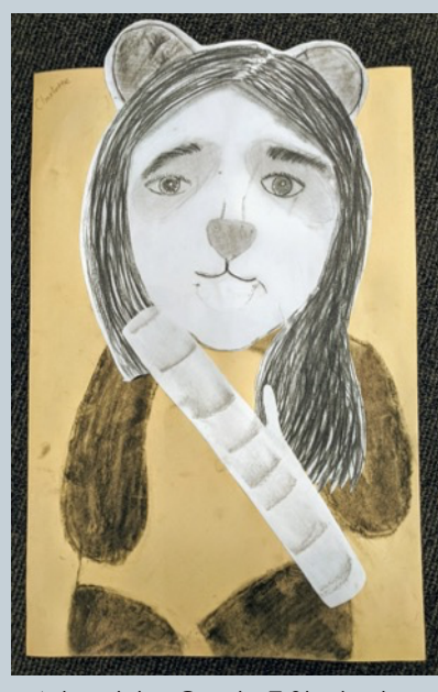
Artwork by Grade 7 Student, Cleveland Elementary

• PERSONAL AND SOCIAL: What strengths and abilities does the animal you chose to include in your hybrid self-portrait have? How do these connect to your own strengths and abilities?