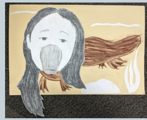
Artwork by Grade 7 Student, Cleveland Elementary