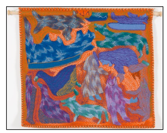
Elizabeth Angrnaqquaq, Untitled , 1981, melton cloth, thread, wall hanging, 26 x 28 inches