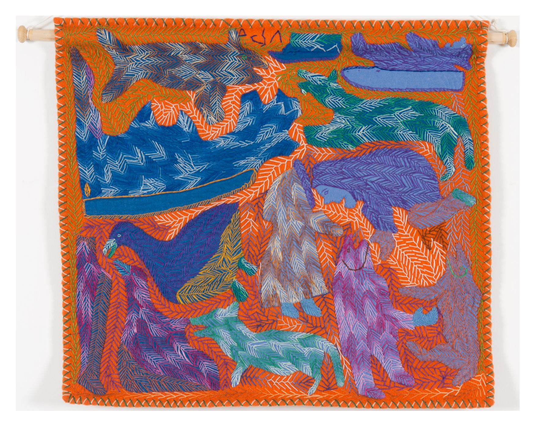
Elizabeth Angrnaqquaq, Untitled , 1981, melton cloth, thread, wall hanging, 26 x 28 inches