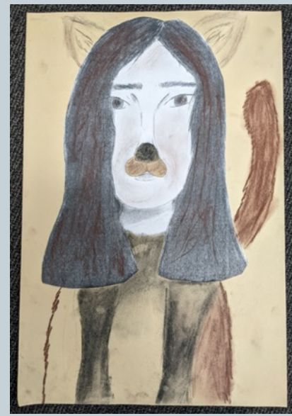
Artwork by Grade 7 Student, Cleveland Elementary