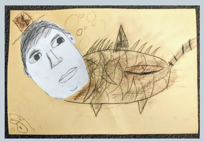
Artwork by Grade 7 Student, Cleveland Elementary