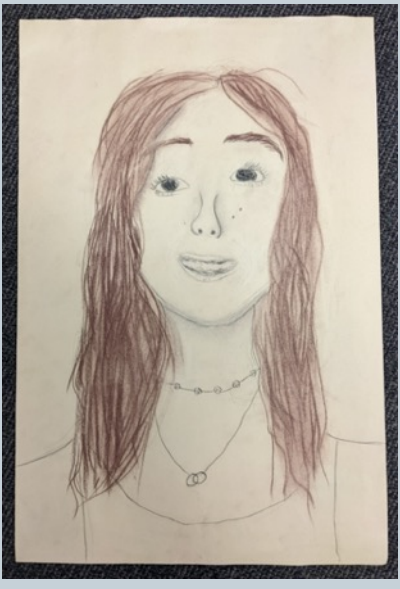
Artwork by Grade 7 Student, Cleveland Elementary