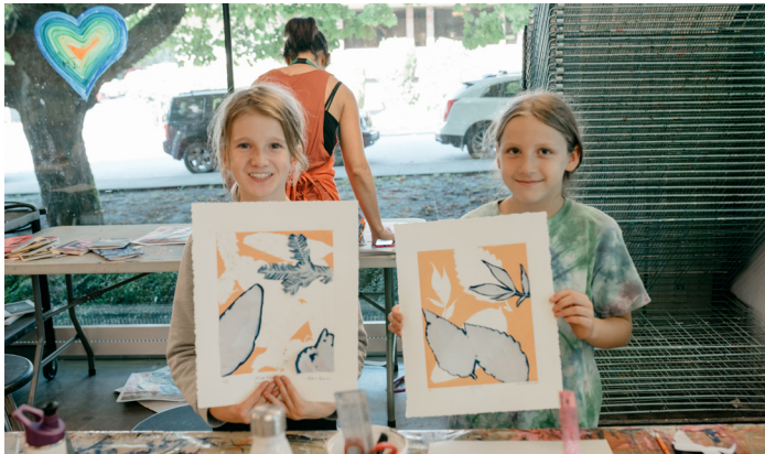
Proud summer day campers showing their work