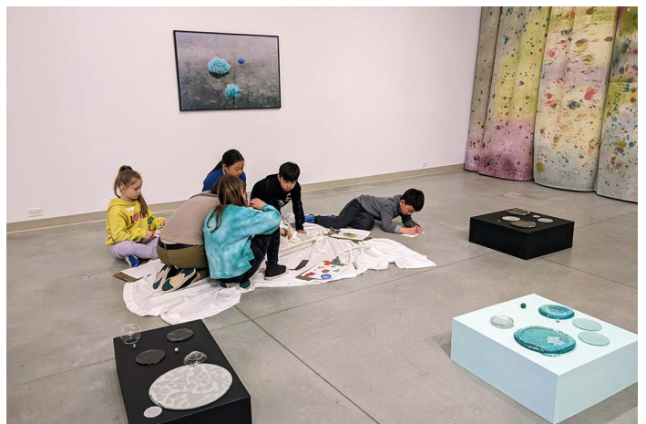
Students in grades K-12 visited the Endless Summer exhibition during the Spring Gallery Program

Number of primary classes: 20 Number of intermediate classes: 19 Educators supported and mentored: 46