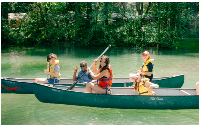
Art break! Campers enjoying the beautiful outdoors!