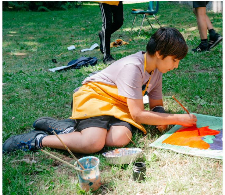
Bringing the studio outdoors at Paradise Valley Camp!

Seventy-two young artists enjoyed outdoor studio adventures with teams of experienced art teachers and one of Canada's finest artists. Campers received in-depth instruction in collage, drawing, painting and printmaking, and took part in canoeing, hiking, cave exploration, campfire singalongs and a variety of fun filled outdoor games.