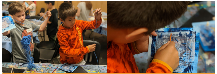
Students inspired by the work of artist Charlene Vickers.

Number of classes visiting the gallery: 42 Number of educators mentored: 47 Number of elementary schools visiting: 23