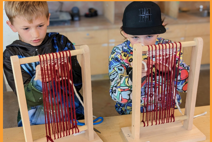
Grade 3 students learned twining and twilling weaving techniques.