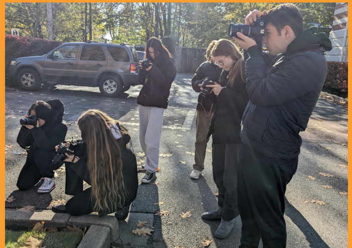
Senior students exploring the relationship between photography and place at The Shipyards in North Vancouver.