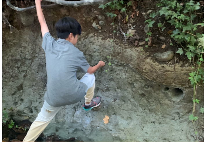
A summer day camper explores Wagg Creek during recreation break.