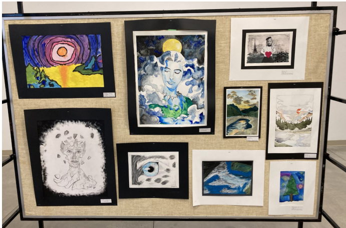
Over 400 students exhibited their work at the Art from 44 District Art Show