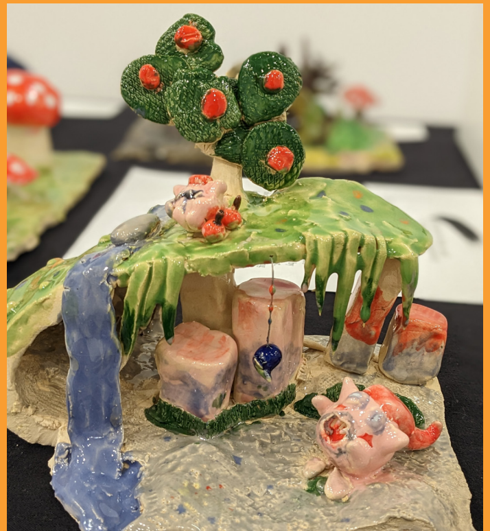
Student artwork from the grade 7 Artist-in-Residence program with Amelia Butcher.