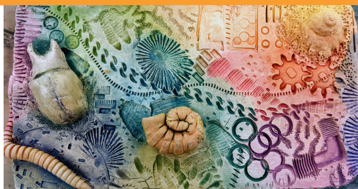
The Clay Kit was launched providing educators with the tools to bring clay into their classrooms.

Pro-D Lesson Sharing - May 20th, 2023 Secondary art teachers from 7 different secondary schools in North Vancouver and West Vancouver came together to share successful teaching practices and lessons.