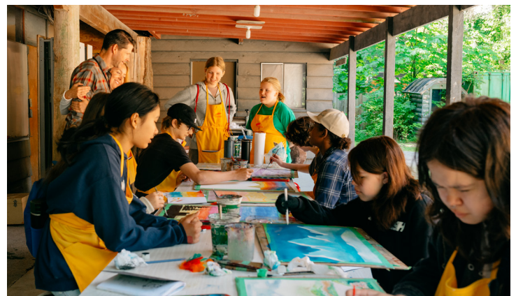
Creating art and memories at camp.