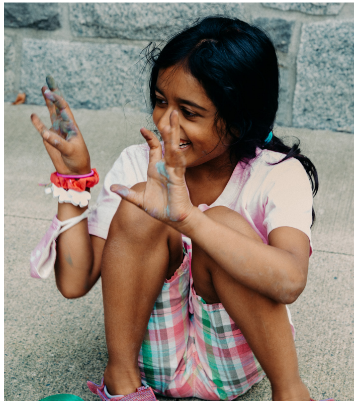
Messy hands, full heart! A young artist is all smiles at day camp.