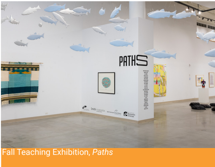
Fall Teaching Exhibition, Paths