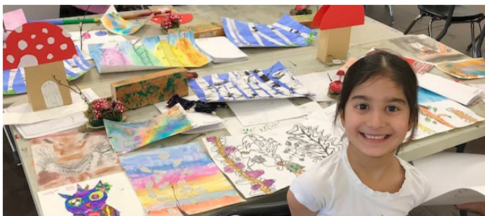
Spring break day campers brought home portfolios full of incredible artwork!