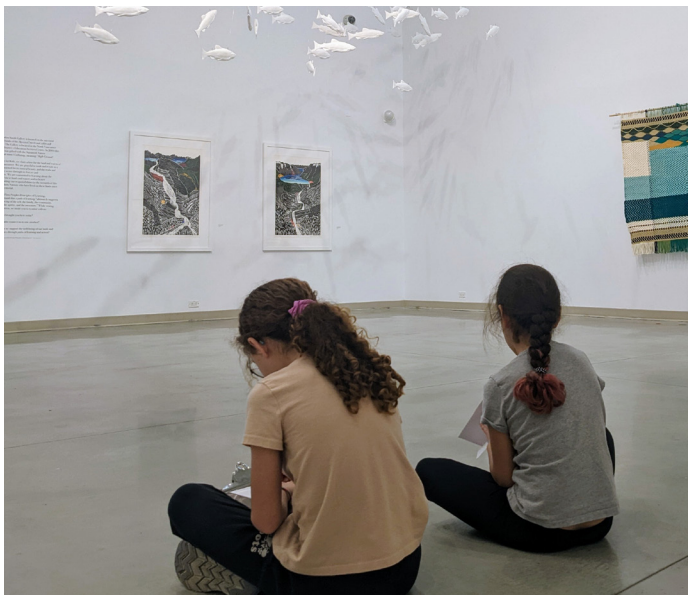
Grade 5 students visiting the Gordon Smith Gallery and experiencing the Paths Exhibition