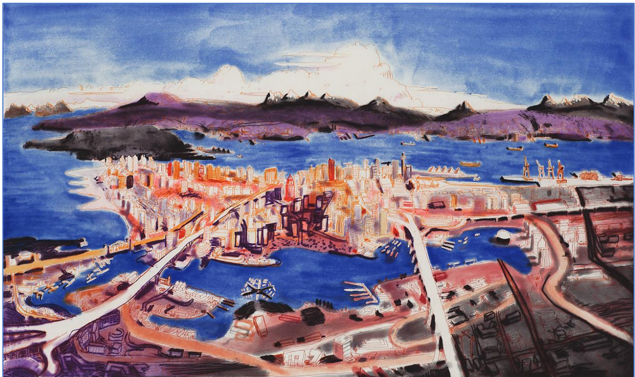
John Hartman, Vancouver, 2011. Four-plate etching. 11 ¾" x 19 ½"

What story does a pathway tell? How do paths connect us? Paths, the 2022-2023 teaching exhibition at the Gordon Smith Gallery will feature artwork by over 20 Canadian artists exploring paths, both real and imagined, through the mediums of painting, drawing, sculpture, photography, collage, and printmaking. The works in the exhibition will show us that a path can be used to communicate a direction, a line of thought, or a plan for action. Paths can also be seen in representations of the natural world, taking the form of forest trails, migratory patterns, maps, and water ways. We invite you to join us at the Gordon Smith Gallery this fall to explore Paths, an exhibition offering opportunities for cross-curricular, place-based inquiry as well as rich connections to social and emotional learning.