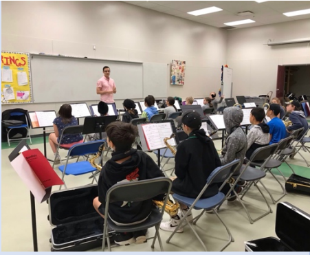
Student engagement in the Band and Strings program was a true testament to the power of the program.