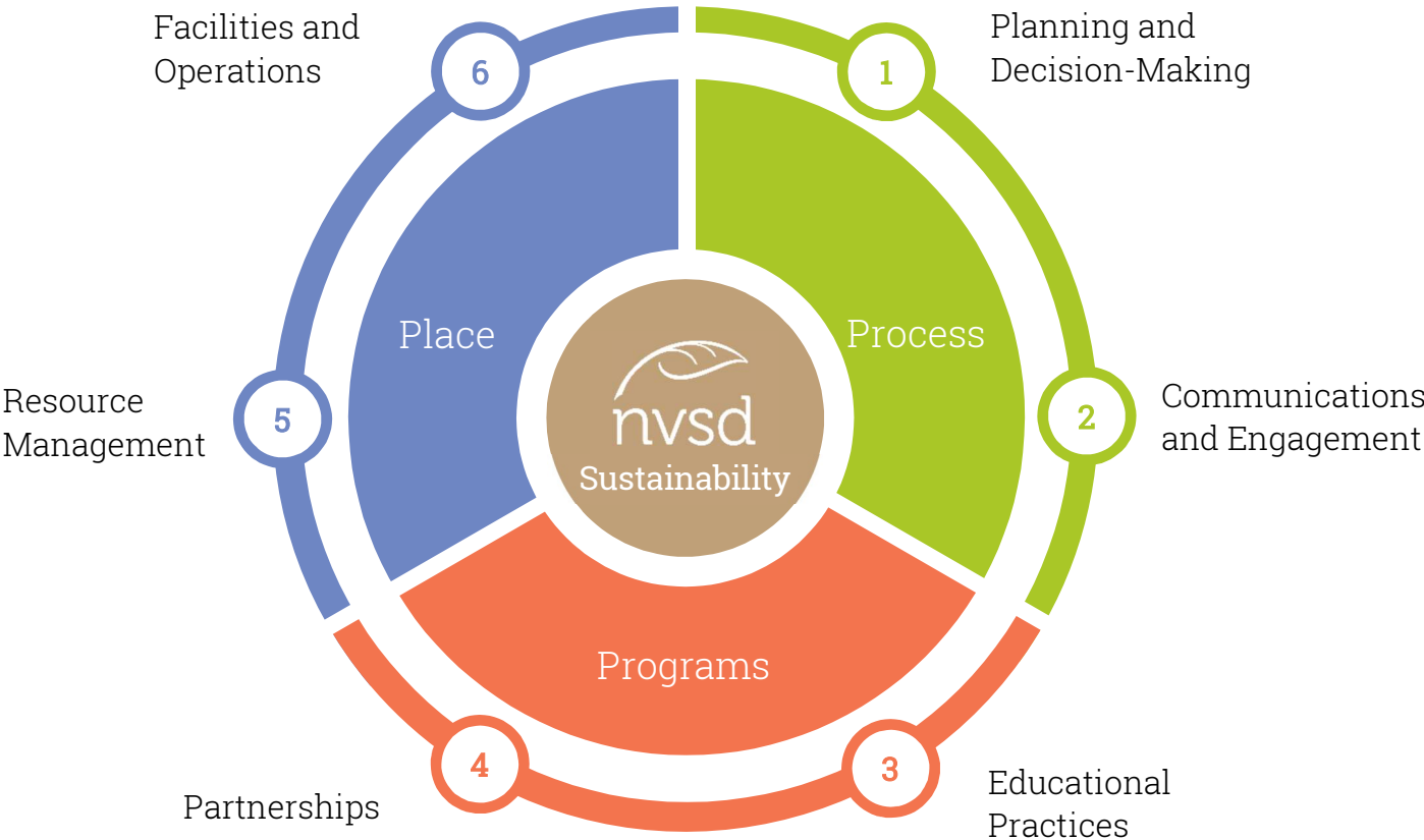
Graphic adapted from US Green Building Council Centre for Green Schools Whole-School Sustainability Framework: http://centerforgreenschools.org/sites/default/files/resource-files/Whole-School_Sustainability_Framework.pdf

We have embraced a district-wide approach to sustainability that includes six strategic priorities within three broad areas of the NVSD community.