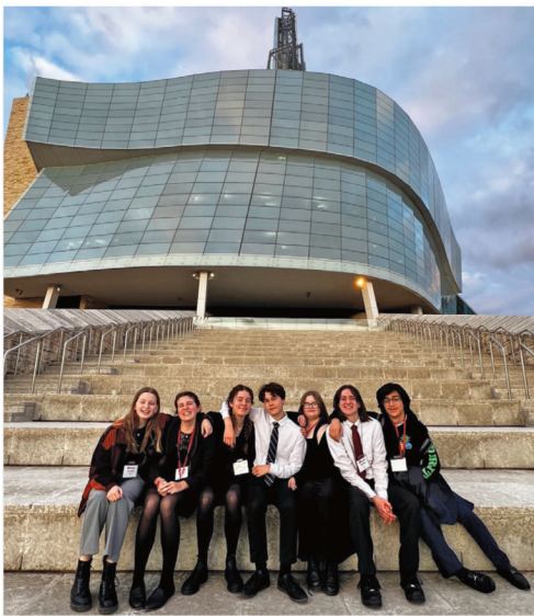
Sutherland Secondary takes 3rd place at the Ethics Bowl Canada National Finals.