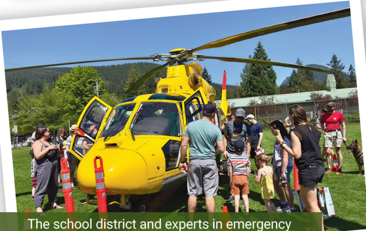
The school district and experts in emergency management host an Outdoor Safety & Emergency Preparedness Open House for the community.