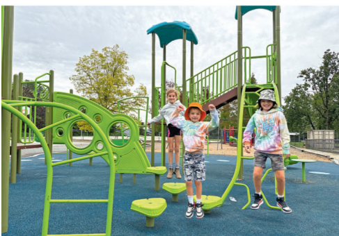
Brooksbank Elementary students jump for joy with their new playground.