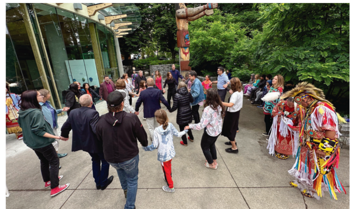
National Indigenous Peoples Day is celebrated at the Education Services Centre.