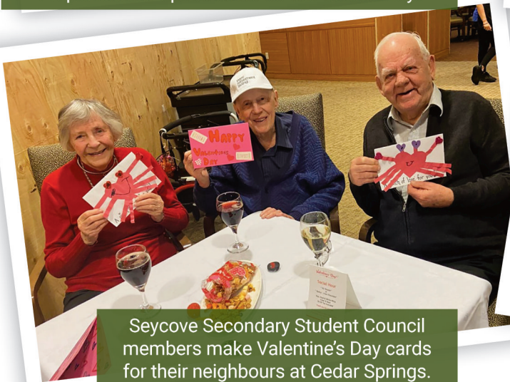
Seycove Secondary Student Council members make Valentine's Day cards for their neighbours at Cedar Springs.