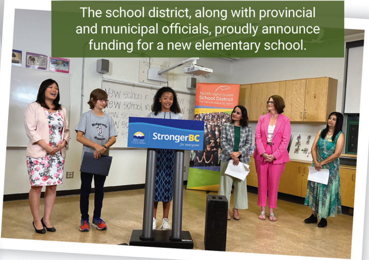
The school district, along with provincial and municipal officials, proudly announce funding for a new elementary school.