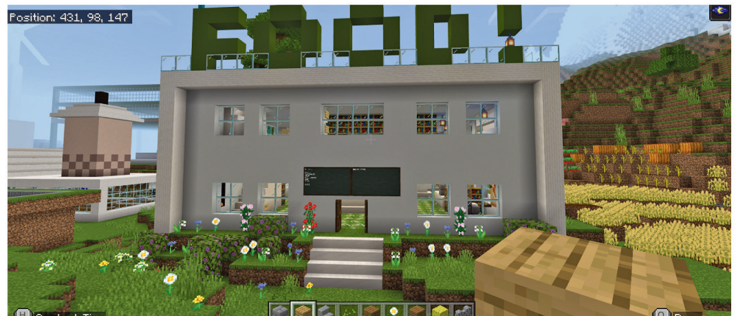
Sustainville's sustainable grocery store.

feature, "The Grandfather Tree is important to Sustainville because it produces oxygen for the city and is a great picnic spot. It is a great habitat for birds and other wildlife and a nice spot to take a break from the sun."