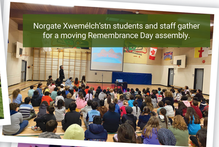
Norgate Xwemélch'stn students and staff gather for a moving Remembrance Day assembly.