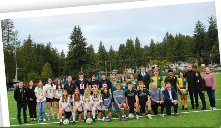
Argyle Secondary student athletes, staff, coaches, PAC representatives, district staff, trustees and municipal officials celebrate the opening of the artificial turf field.