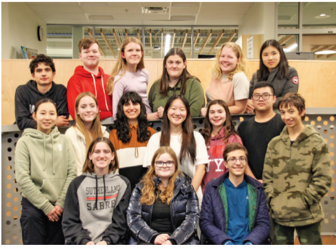
District Student Leadership Council members provide leadership, voice and student perspective on education in North Vancouver.