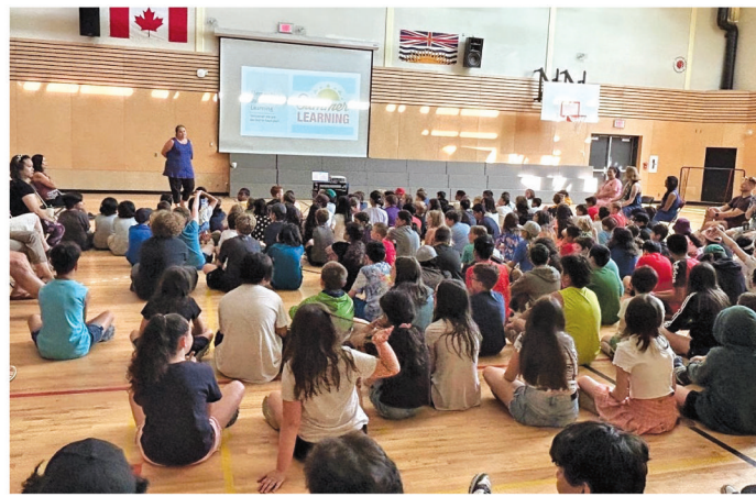
Students and staff attend the Welcome to Summer Learning assembly.

In 2023, Elementary Summer Learning took place at Queen Mary