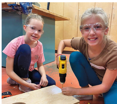
Students ages 9 to 12 participate in a Discovery Trades Summer Camp.