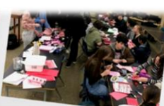
Student Council Early Morning