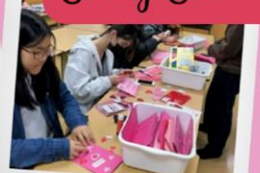
Lunch Hour Session in the Art Room