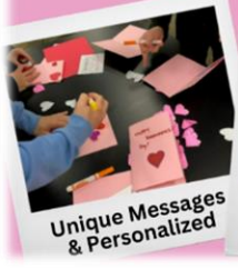
Unique Messages & Personalized