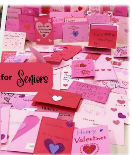
Caring Cards for Seniors