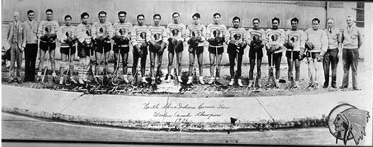
1936 North Shore Indians

The teams over the years have always included other First Nations as well as players from all cultures. This inclusive approach provided for a family atmosphere that instilled pride in all people no matter where they came from.