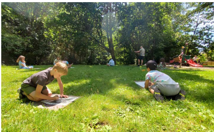
The best part of summer camp is taking the studio outdoors!

*Supported by the Quan Family and CUPE #389