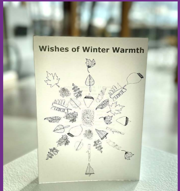
2020 Superintendent's Holiday Card