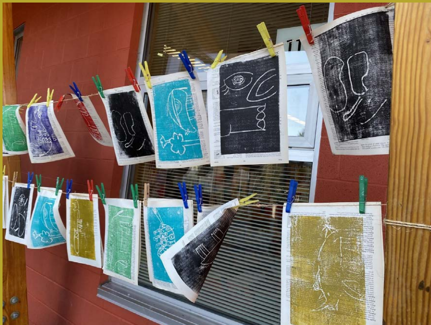
Student artwork drying outside Lynn Valley Elementary