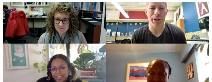
Screenshot from teacher workshop session.