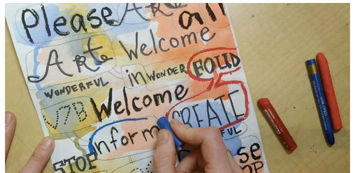
AFK Art Reach Video # 5 Transforming Words into Art

Mentoring of Art Education curricula: limitless