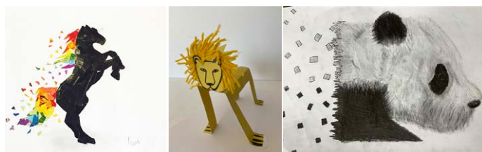
Examples of student artwork from AFK's virtual After School Art classes

Number of classes: 12 Number of Students: 190 Number of bursaries: 6