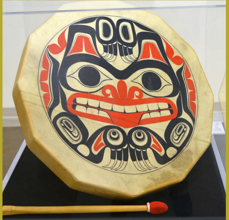
The ceremonial drum, pictured here, is part of Artists for Kids' permanent collection.

We are able to show our gratitude once more to Bill Reid, as one of the founding artists who helped to build Artists for Kids, now 30 years old, by continuing to support kids, educators and artists.