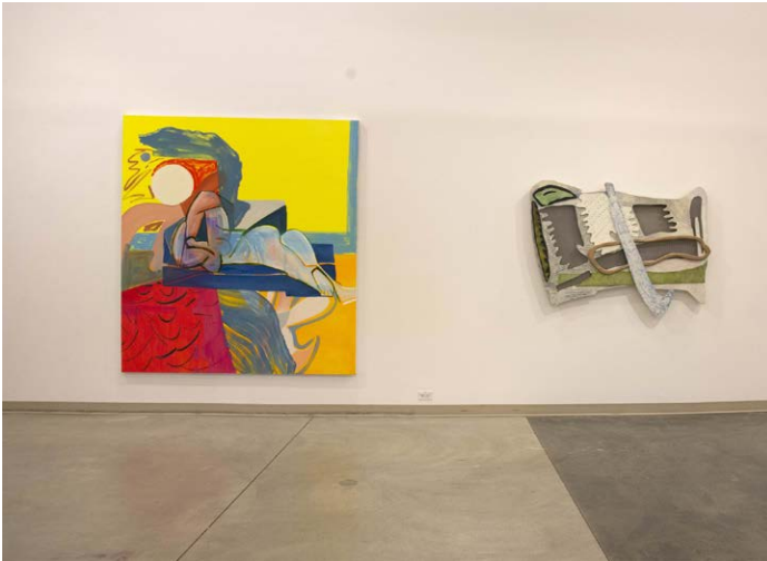
Installation image of the Play exhibition