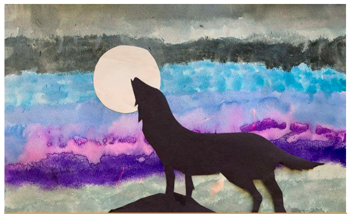
Artwork by Ainsley from Blueridge Elementary on display in the Art from 44 Virtual Student Exhibition.

Schools participating: 21 Number of students exhibiting: 288