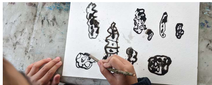
Creating nature-inspired sketches at Larson Elementary