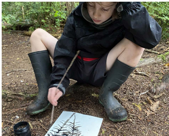
A student from Eastview Elementary inspired by the natural environment