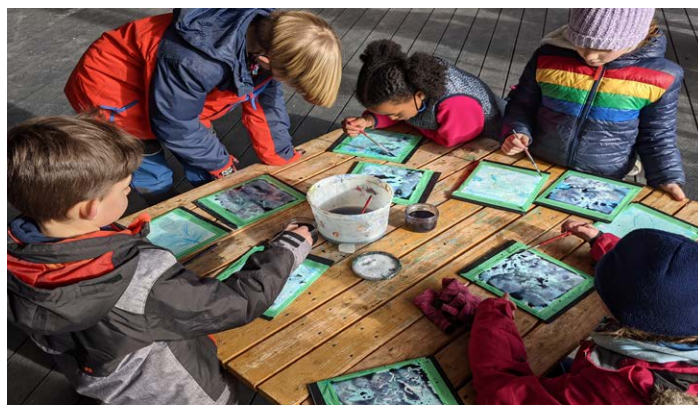
Students from Seymour Heights experiment with watercolour