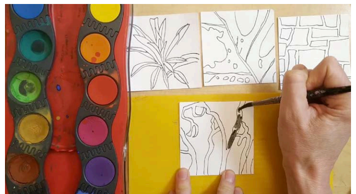
AFK Art Reach Video # 7 Mapping our own Perspectives