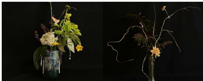
Floral arrangements created and photographed by AFK Art Academy students.