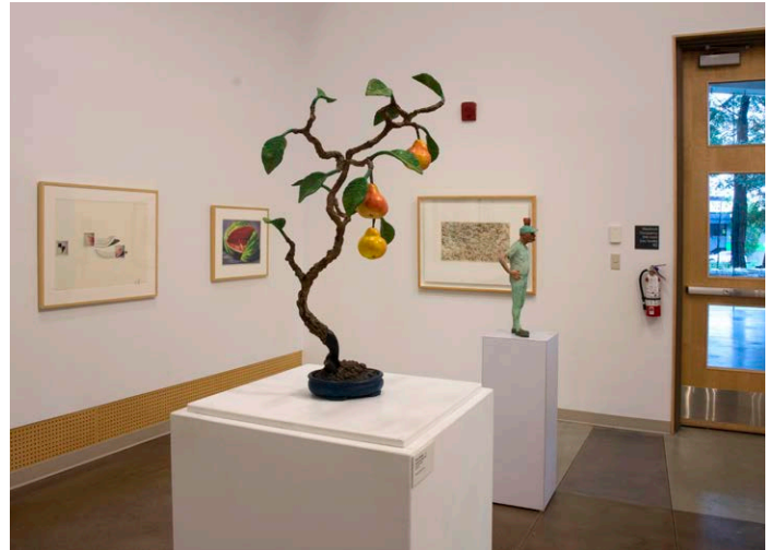
Installation image of the Play exhibition