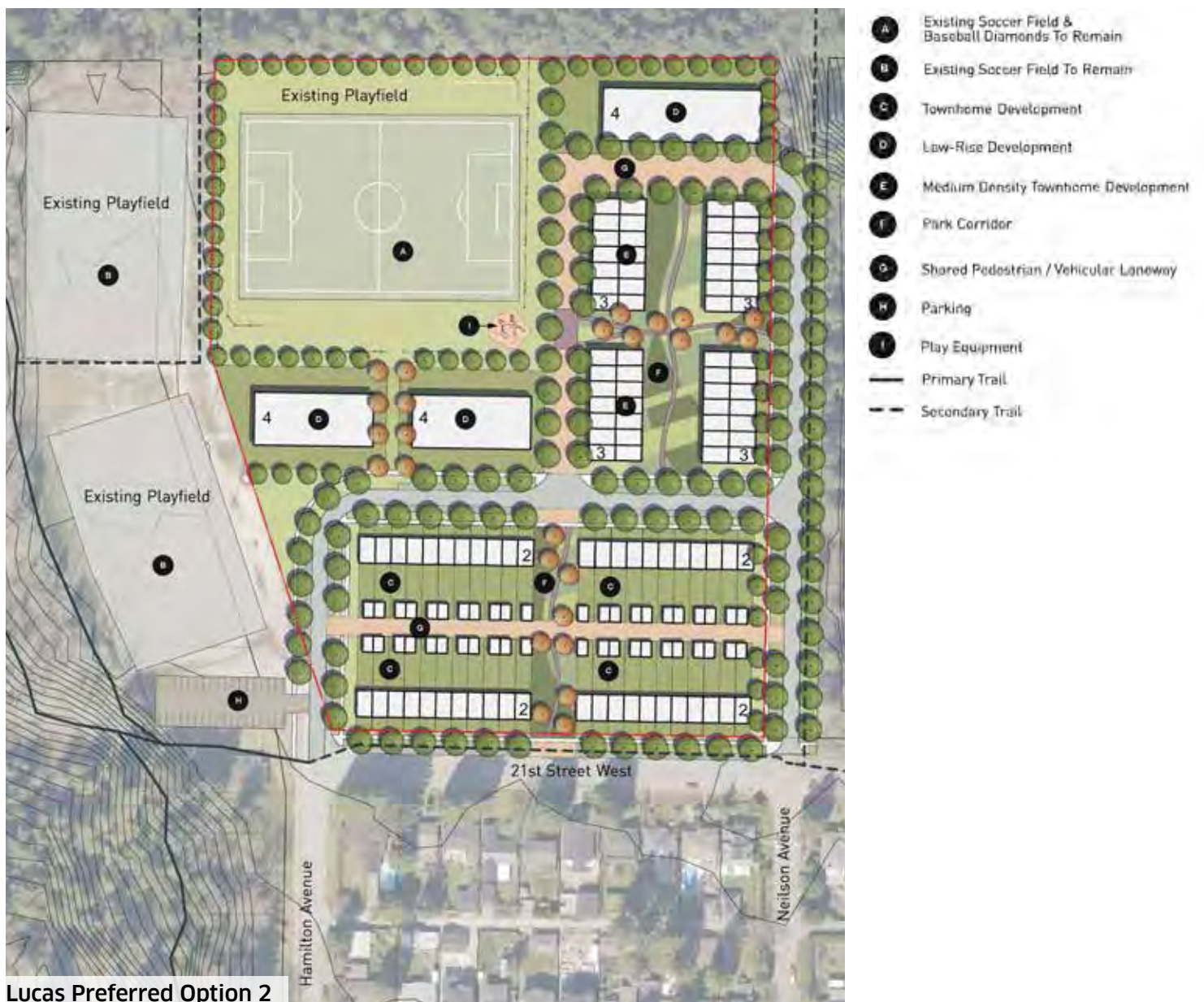
Lucas Preferred Option 2

Option 2 generally seeks to maintain the status quo in terms of both the extent and location of open space and utilize the remaining portion of the site for residential development. This option incorporates 2- to 3-storey townhouses and 4-storey residential apartments in an effort to maintain a lower-scale form of building in the neighbourhood. Additional linkages are provided within the residential framework to contribute to better connectivity between the on-site open space and the residential community to the south. This option could generate roughly 180 units, including about 90 townhouses. There may be an opportunity to increase open space and improve the open space network through modest changes to this plan including increasing building heights from 4 to 6 storeys.