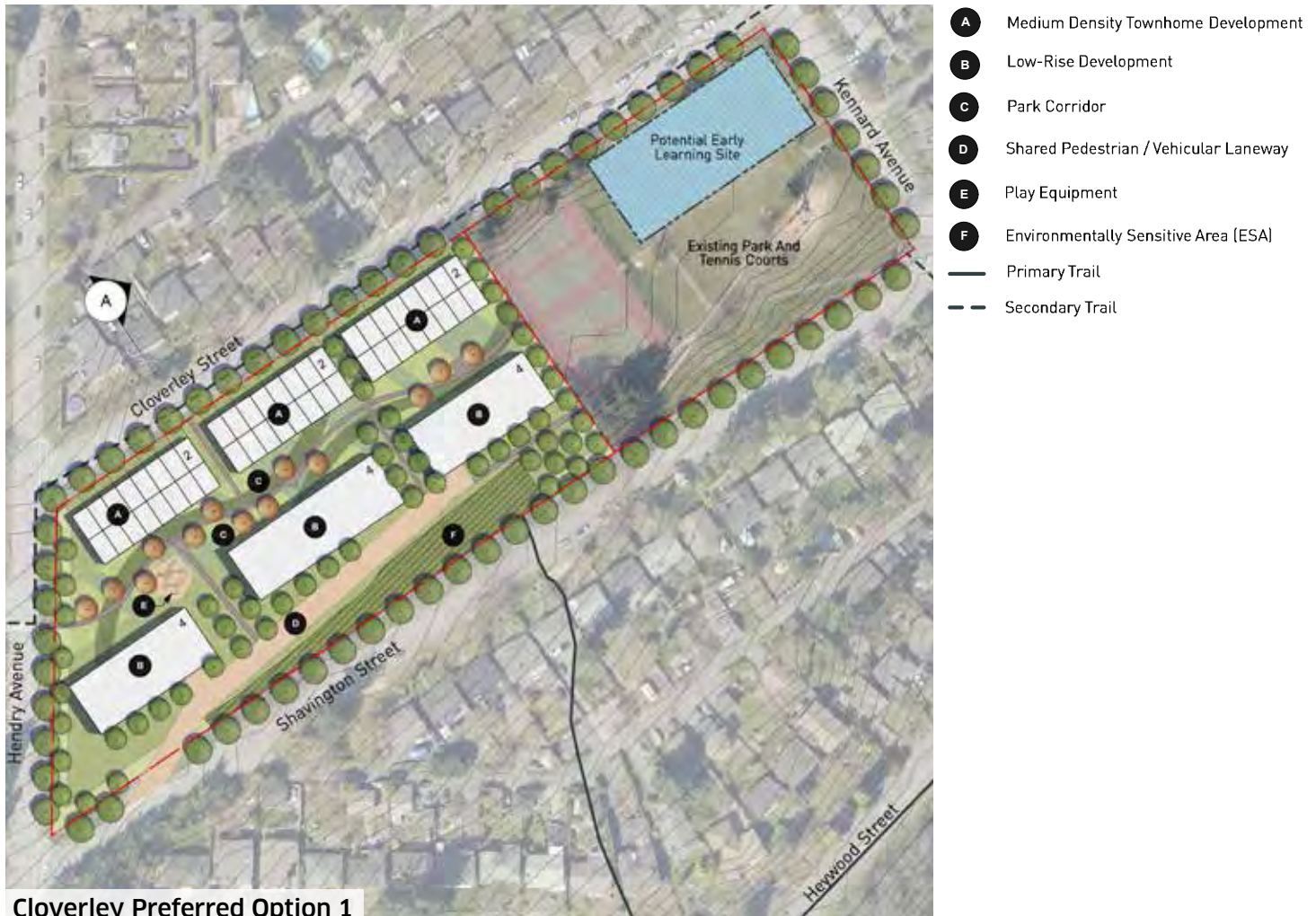
Cloverley Preferred Option 1

Option 1 incorporates an open space equivalent in size to the open space currently on site that is leased to the City as park. The western portion of the block is envisioned for development including 2-storey back-to-back townhouses along Cloverley Street (terraced to respond to the sloping site) and 4-storey apartment buildings (3-storey when viewed from the interior courtyard) along an access driveway accessed off of Shavington Street. The access driveway must not overlap with the identified Environmentally Sensitive Area. An advantage of situating buildings of these heights in these locations is that it will still allow for overlook across the site from houses located north of Cloverley Avenue.