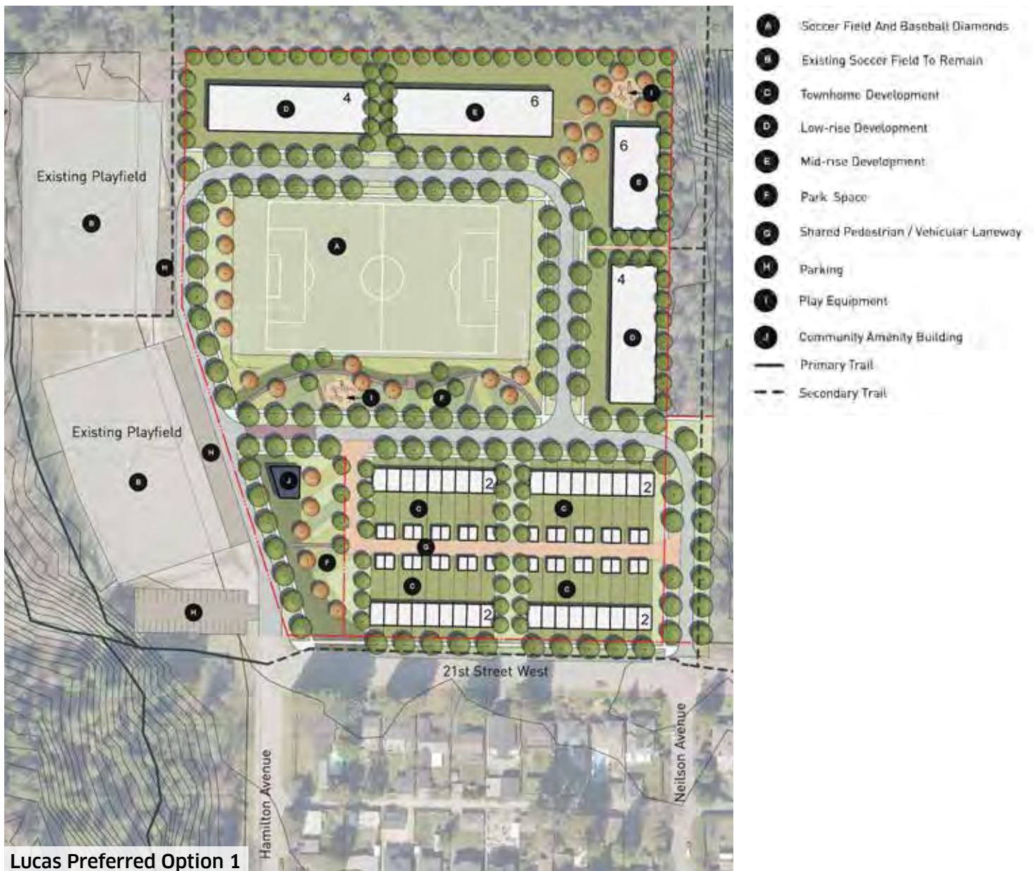
Lucas Preferred Option 1

Option 1 incorporates a playfield of the equivalent size of the existing playfield in an area central to the site. This facilitates the creation of a shared community park that is a central gathering space. Additional open space is provided to create a stronger physical and visual connection between the existing community to the south and the on-site open space. A community amenity building is also shown. The option includes 2- to 3-storey townhouses, 4-storey apartments, and 6-storey apartments. The lower scale development is located towards the south so as to better relate to the single-family development south of 21st Street. This option could generate approximately 290 residential units, of which approximately 35 units are townhouses.