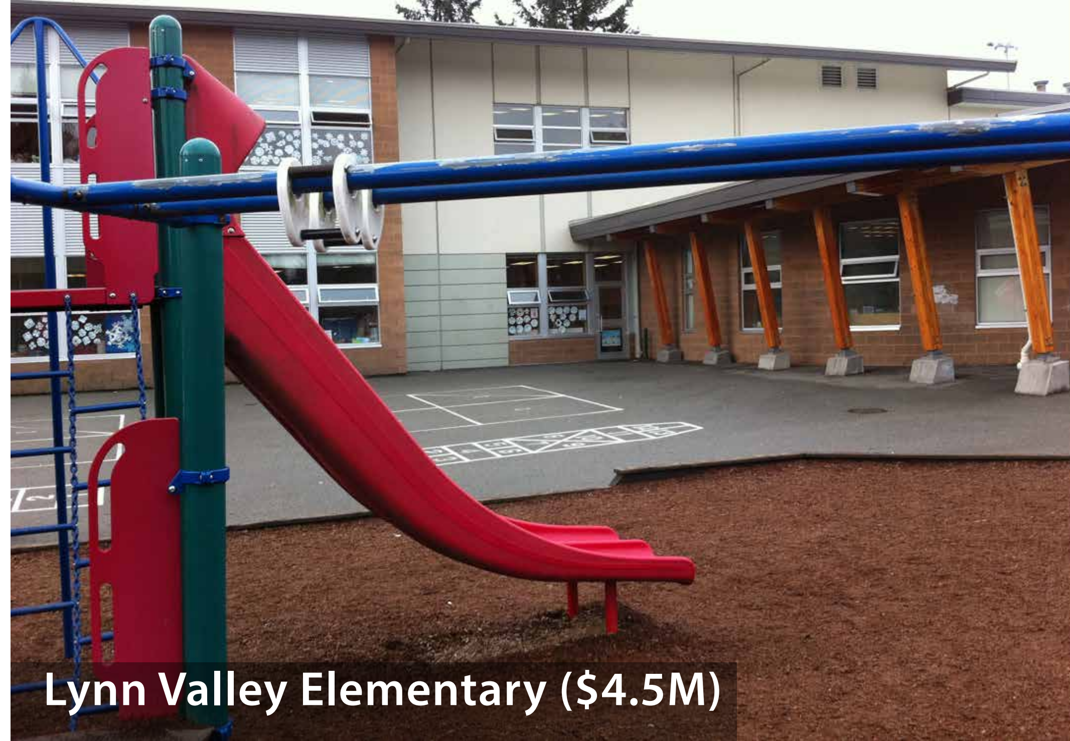
Lynn Valley Elementary ($4.5M)

The NVSD has completed several capital projects involving school expansions and the replacement of outdated buildings with new, modern, energy efficient schools that are able to accommodate a larger number of students. Since 2004, new and replacement schools, rehabilitations, and upgrades with a combined value of over $200M have been built: