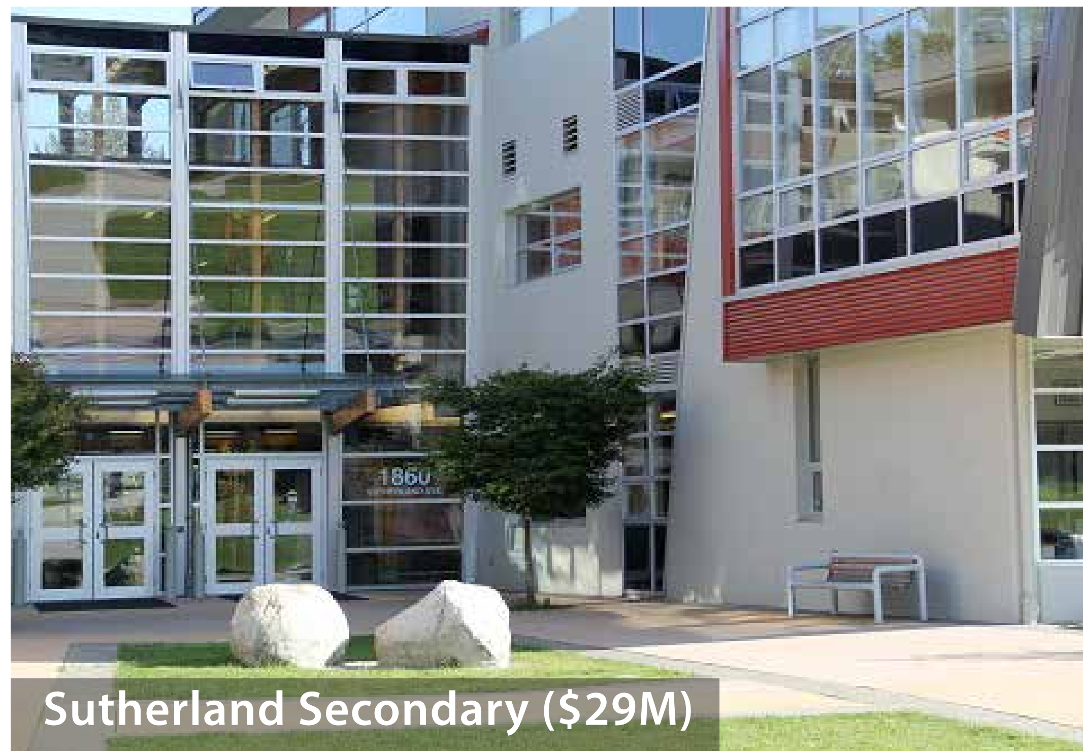
Sutherland Secondary ($29M)