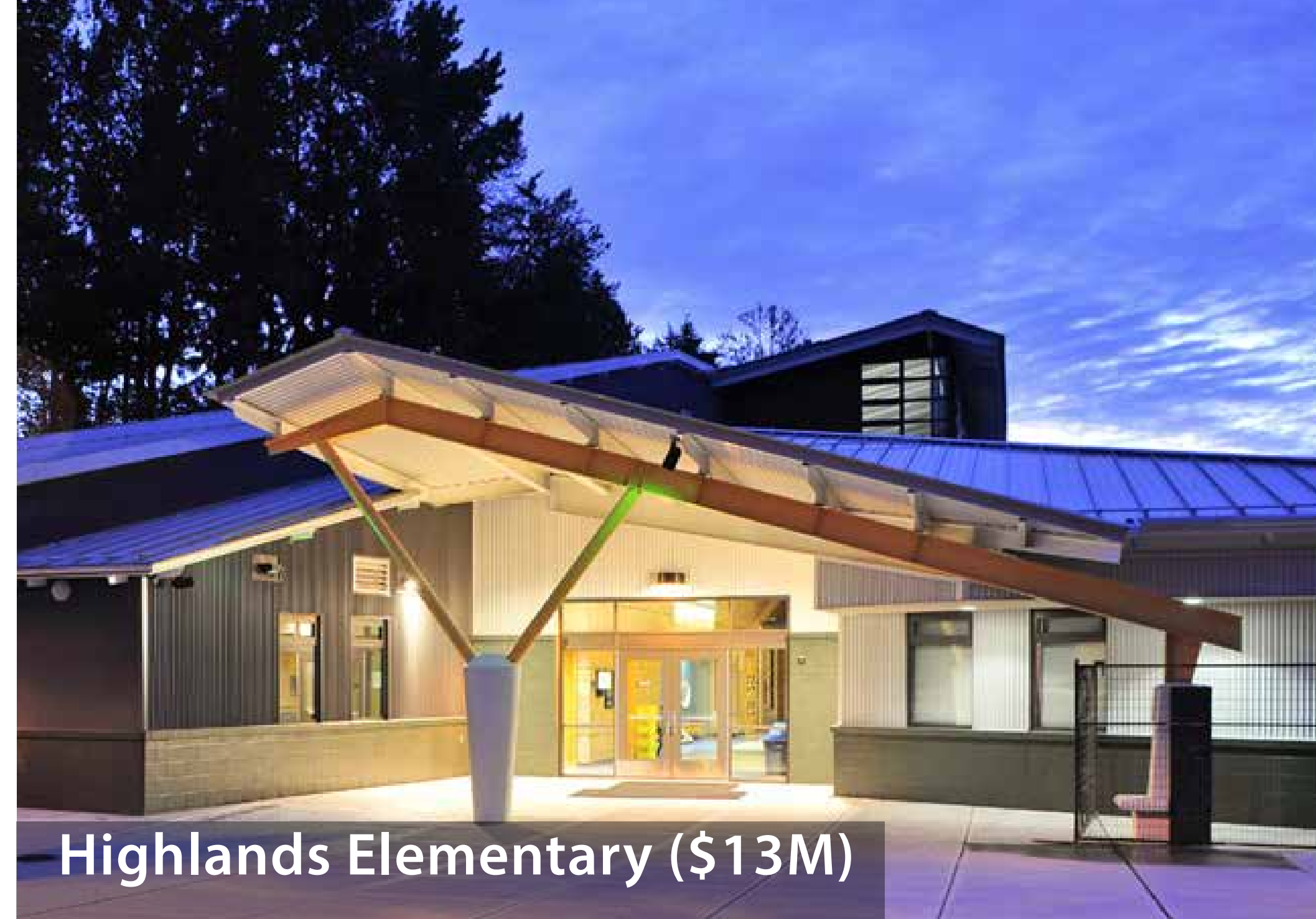
Highlands Elementary ($13M)