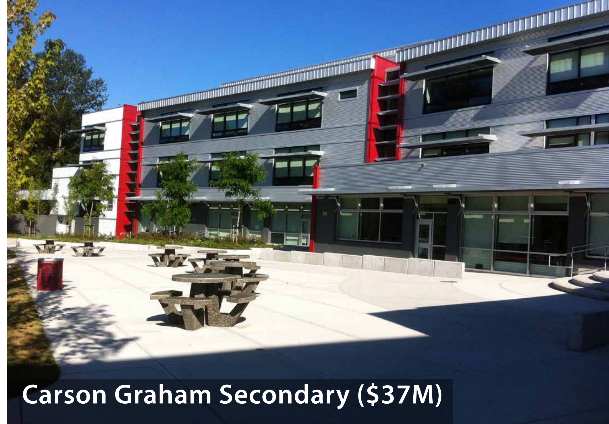
Carson Graham Secondary ($37M)