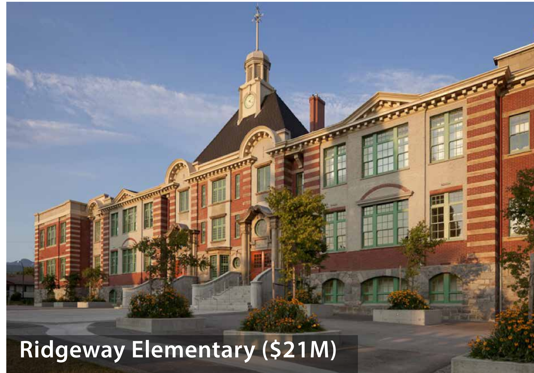
Ridgeway Elementary ($21M)