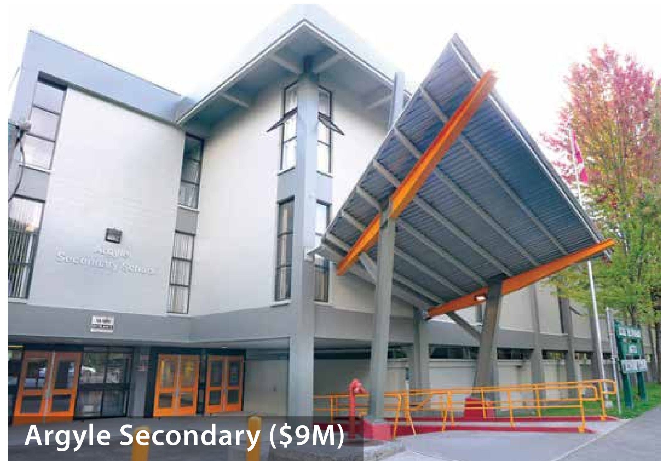
Argyle Secondary ($9M)