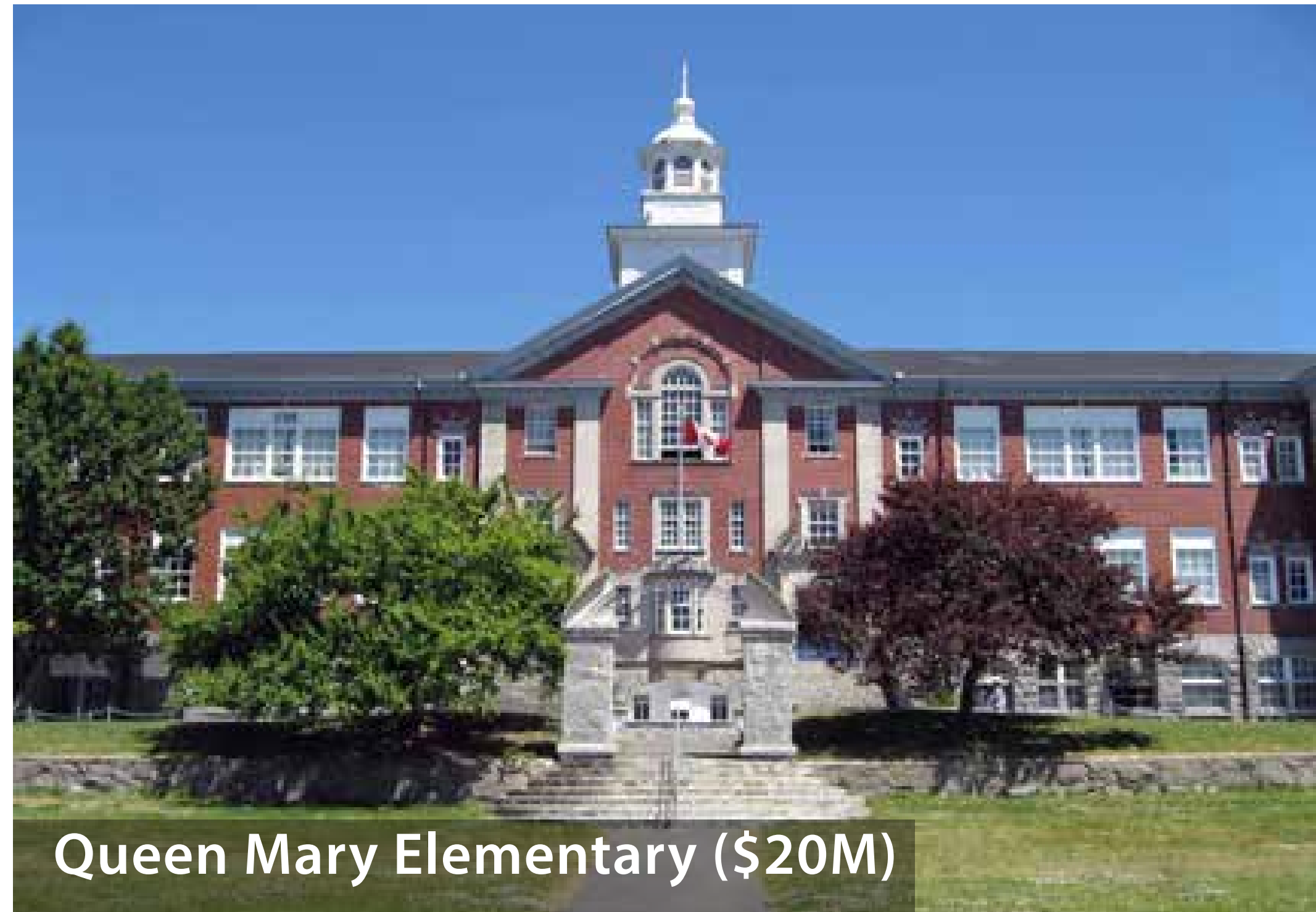
Queen Mary Elementary ($20M)