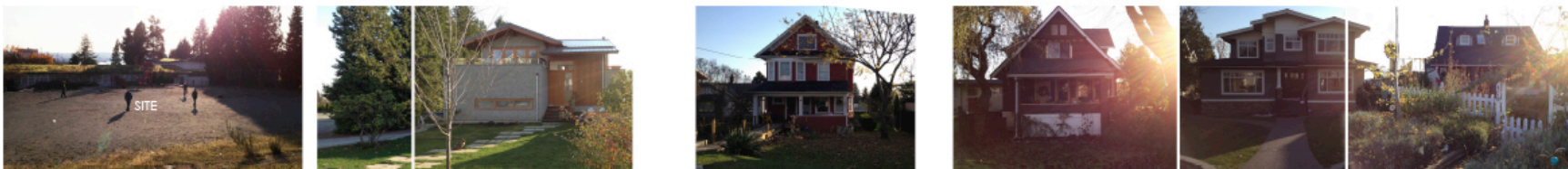
6TH STREET STREETScape