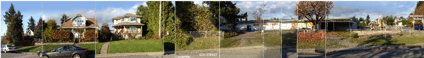
5TH STREET STREETScape