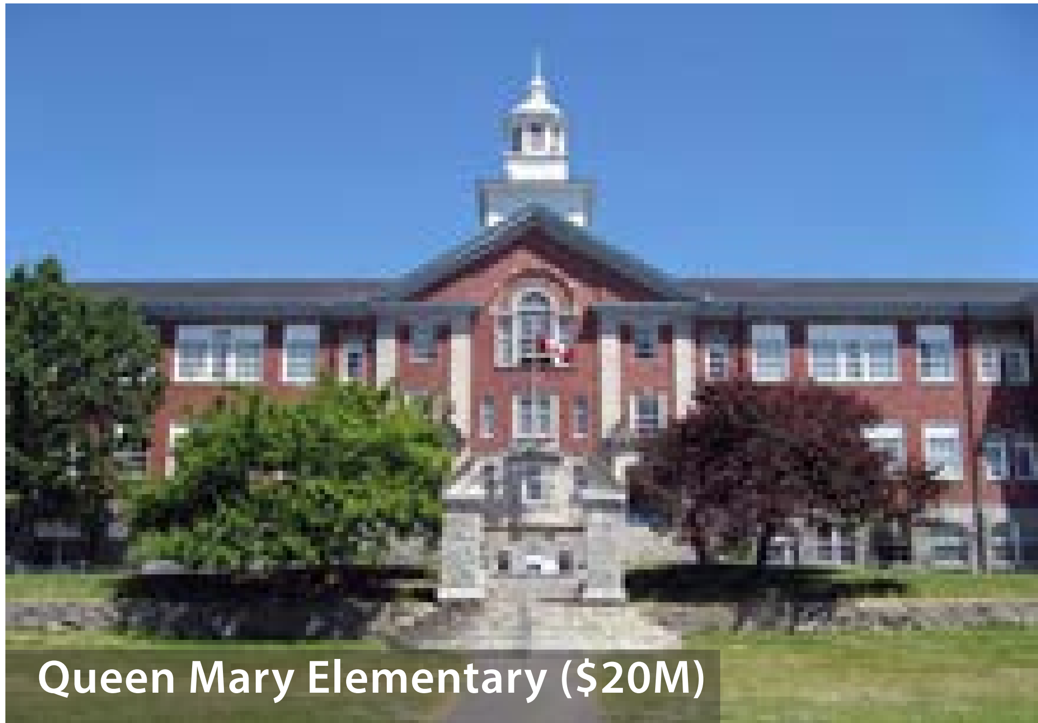
Queen Mary Elementary ($20M)