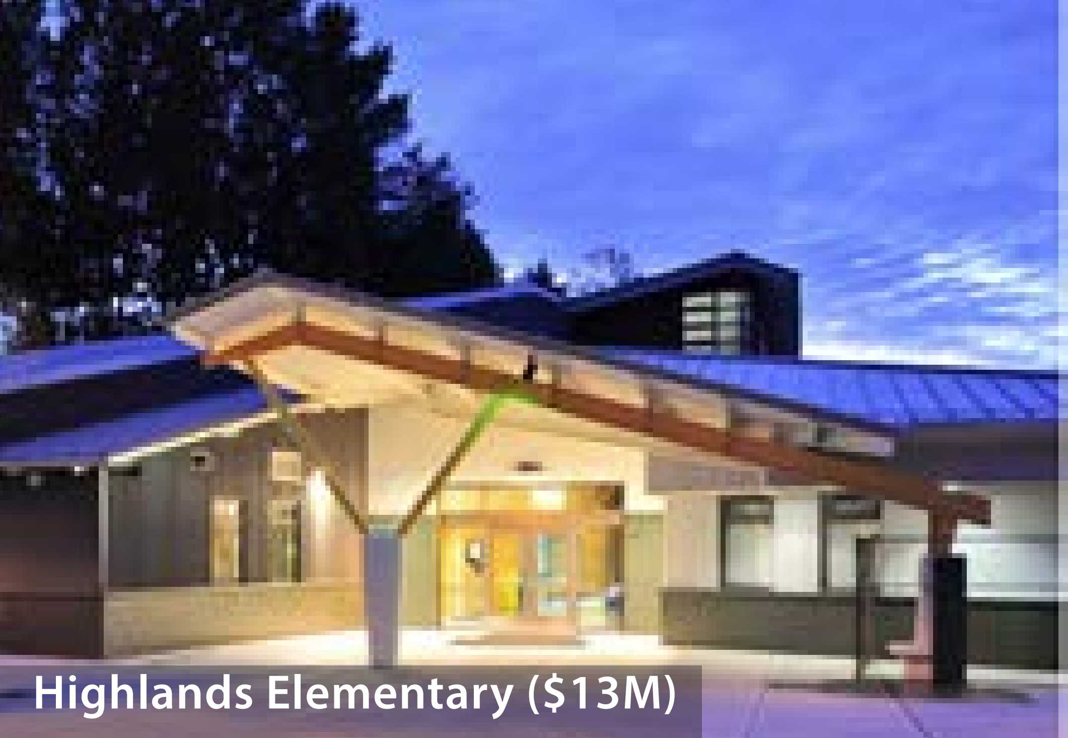
Highlands Elementary ($13M)