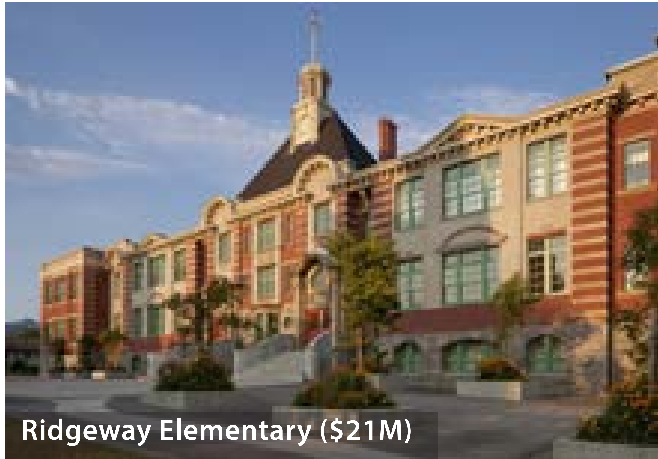
Ridgeway Elementary ($21M)