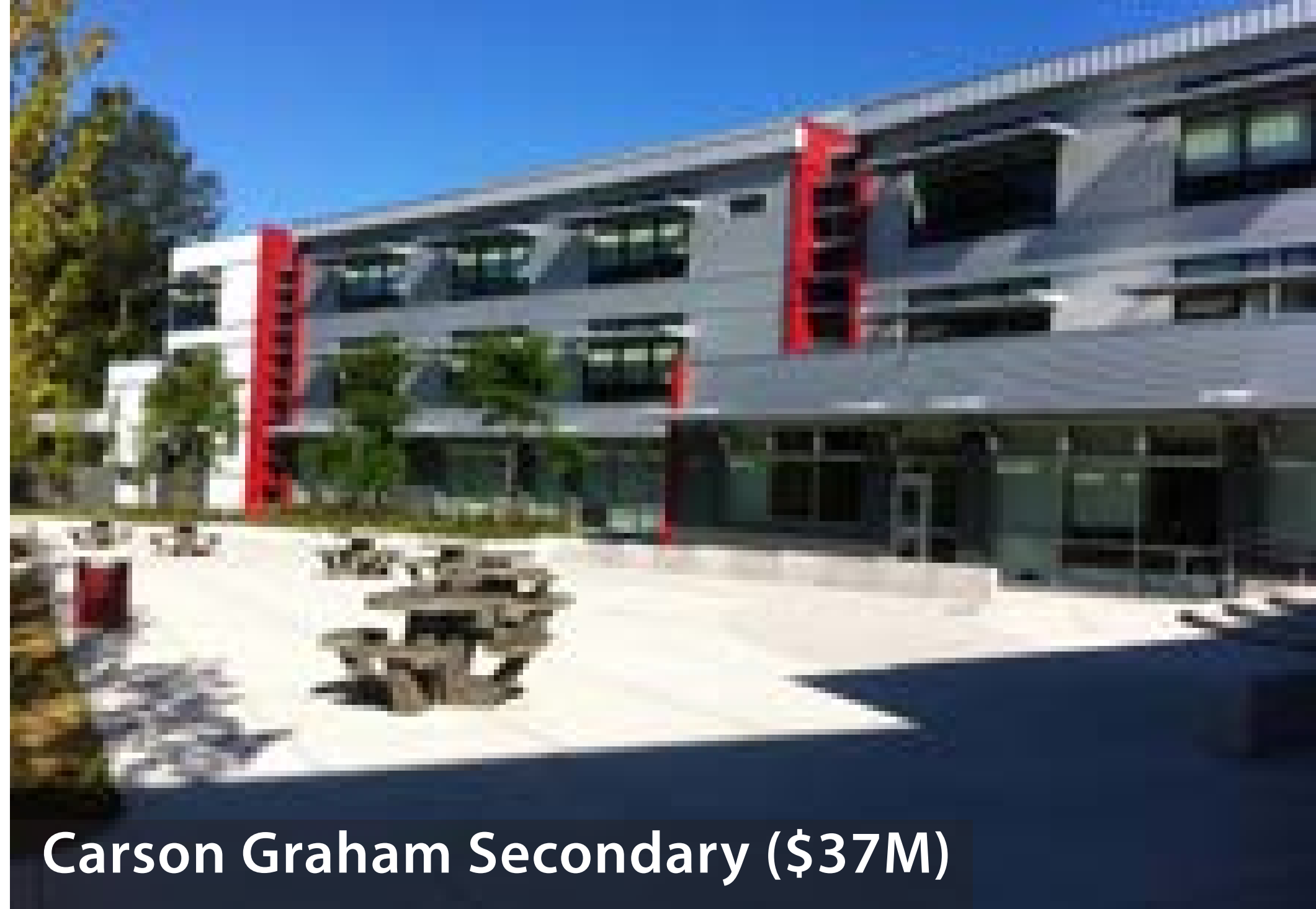
Carson Graham Secondary ($37M)