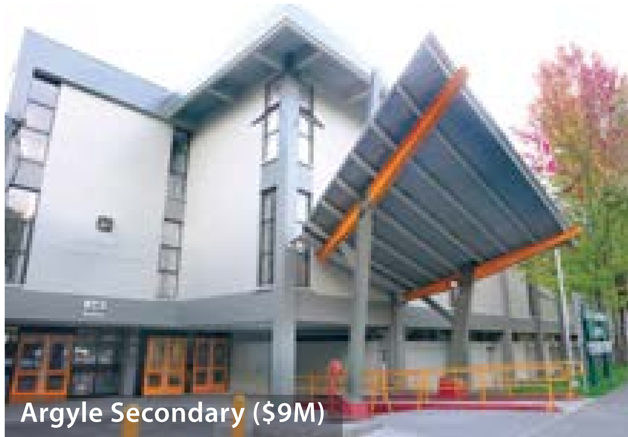
Argyle Secondary ($9M)