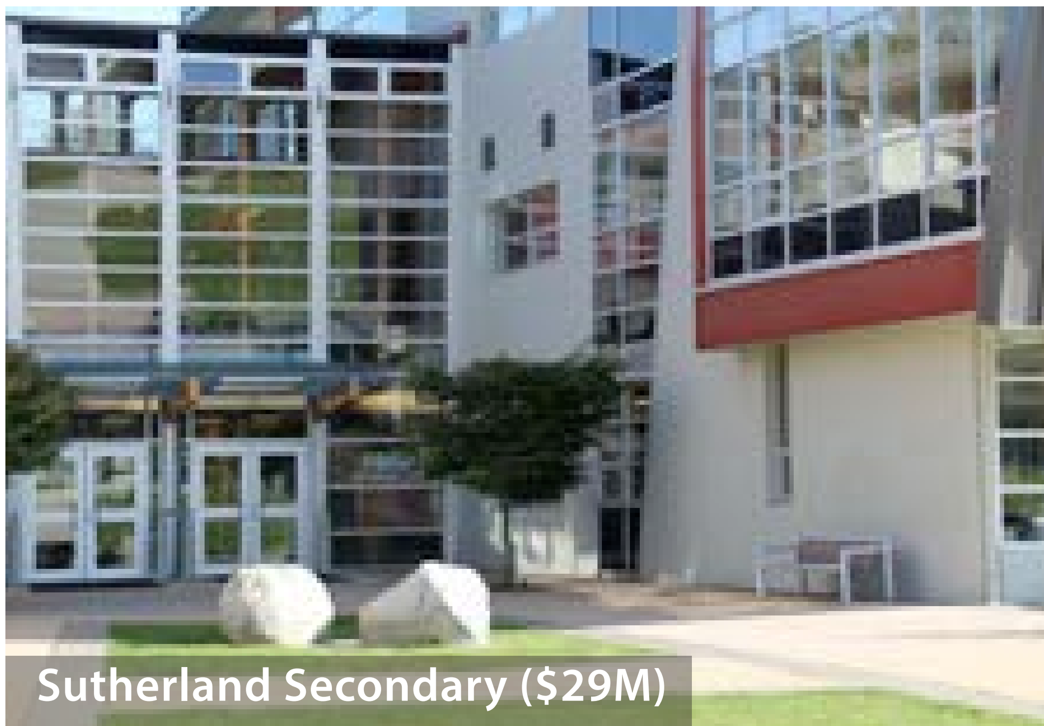
Sutherland Secondary ($29M)