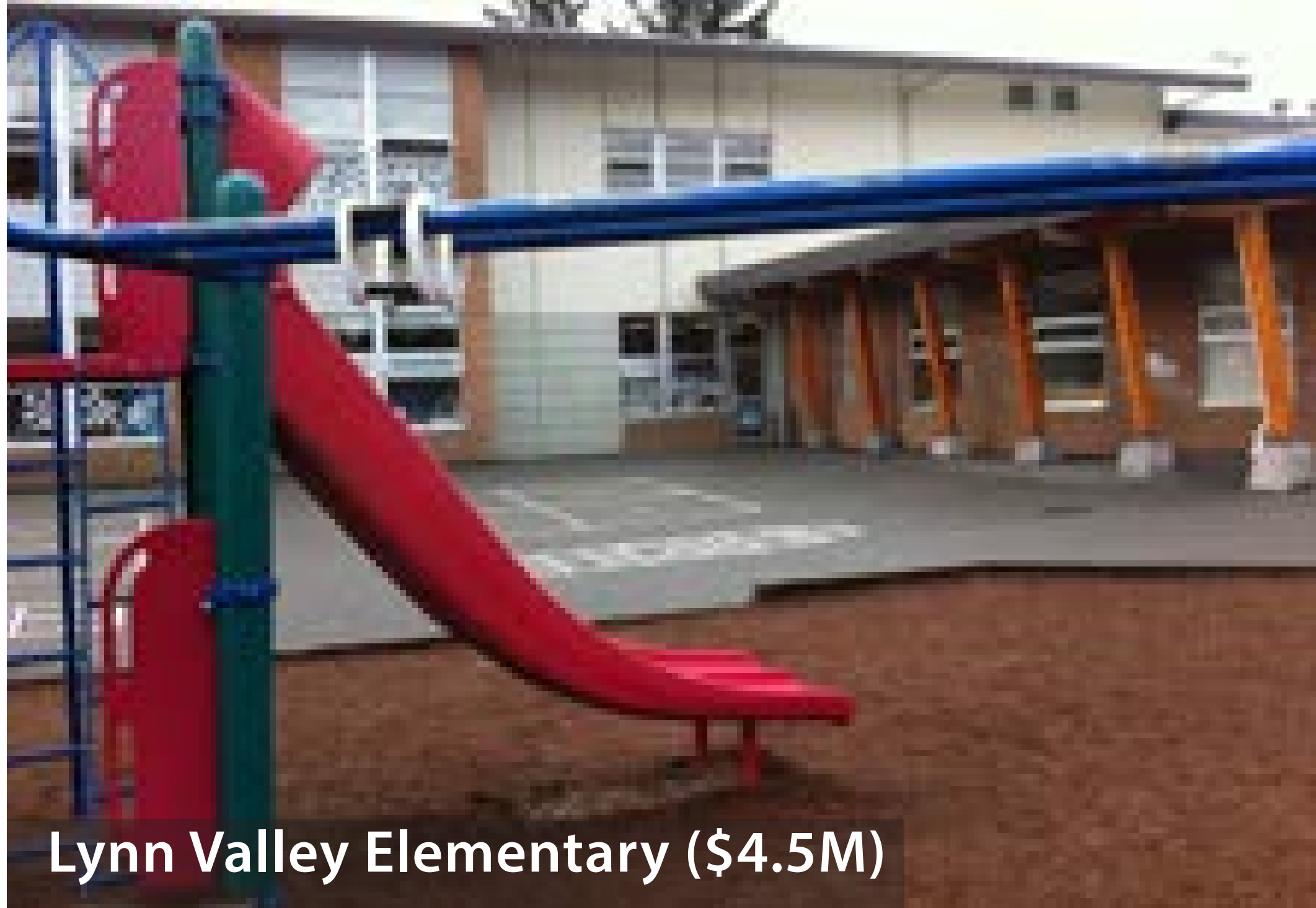
Lynn Valley Elementary ($4.5M)

The NVSD has completed several capital projects involving school expansions and the replacement of outdated buildings with new, modern, energy efficient schools that are able to accommodate a larger number of students. Since 2004, new and replacement schools, rehabilitations, and upgrades with a combined value of over $200M have been built: