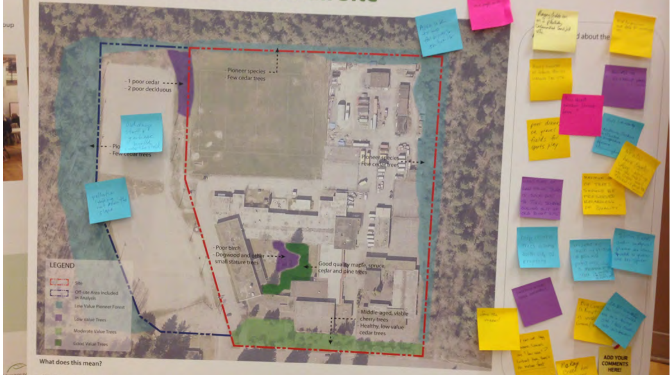
Lucas Open House