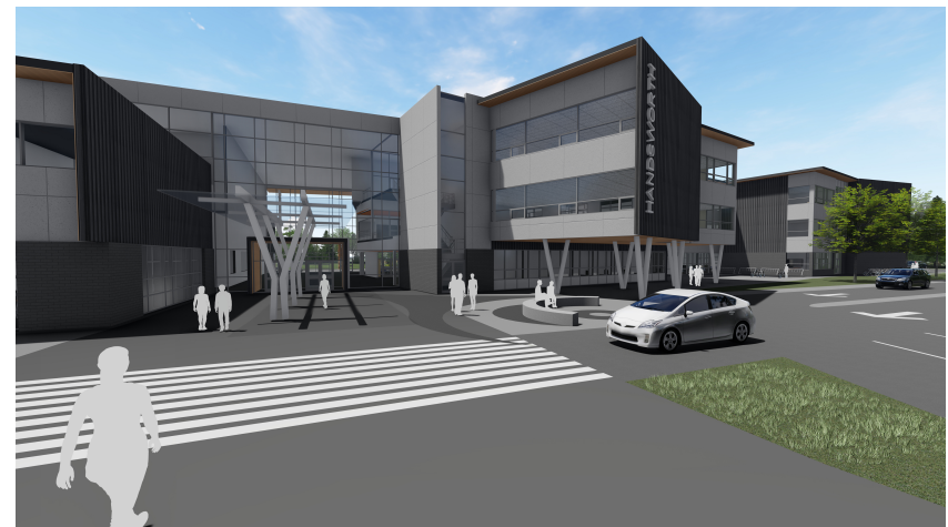
Conceptual representation of front entrance