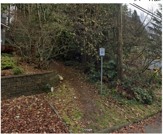
#2 - Trail head on Ramsay, between #4604 & #4592.

Please reach out if you have any questions or want to share ideas on how we can reduce traffic in front of the school and make it safer for everyone!