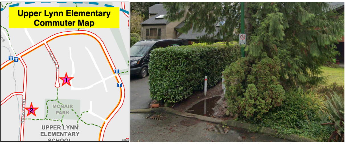
#1 - Trail head off McNair Place between #4645 & #4638.

Try these DNV trails leading straight to the school grounds, which is a familiar place for all students in grade 1 and up! These are drop-off only, as parking is generally restricted north of Coleman, but you can teach your child to walk with siblings/ friends.