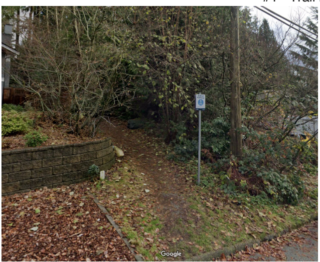
#2 - Trail head on Ramsay, between #4604 & #4592.

Please reach out if you have any questions or want to share ideas on how we can reduce traffic in front of the school and make it safer for everyone!