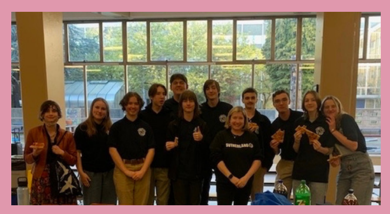
Students who participated in the Reach for the Top Senior Tournament at Windermere Secondary on April 19th. We didn't make it through to the knockout rounds, unfortunately, but every kid got their moment to shine on the buzzer!