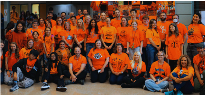
Staff and students at Sutherland standing together in orange to honour Survivors, remember those who never returned home, and commit to the ongoing work of reconciliation. Every Child Matters. Read on to see more of how Sutherland Students acknowledged Truth and Reconciliation Day.