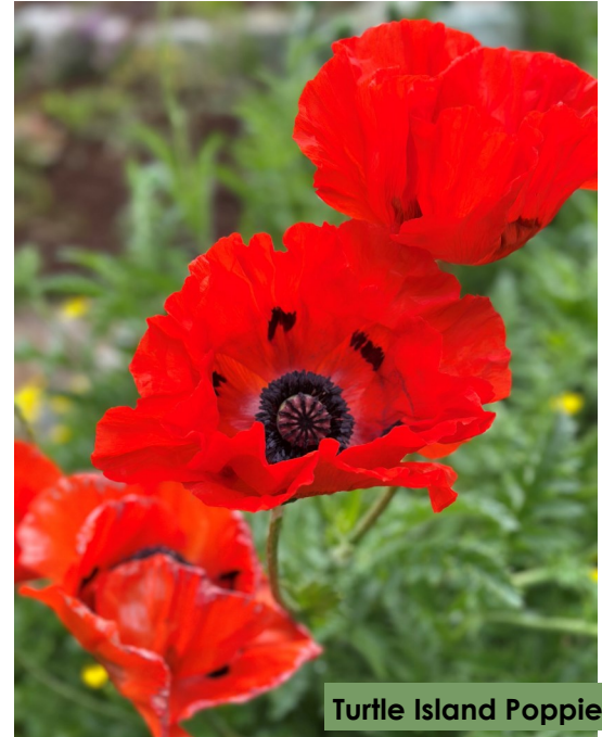
Turtle Island Poppies

Tutorial 8:30am-9:10am Period 2 - 9:10am-10:00am (50 mins) Transition - 10:00am-10:05am Period 3 - 10:05am-10:55am (50 mins) Transition - 10:55am-11:00am (5 mins) Period 1 - 11:00am-11:50am (50 mins) Lunch - 11:50am-12:50pm Opening Ceremony in Gym -12:50pm-1:15pm Period 4 #1 - 1:20pm-1:40pm Period 4 #2 - 1:40pm-2:00pm Period 4 #3 - 2:00pm-2:20pm Period 4 #4 - 2:20pm-2:40pm 2:40pm - 3:00pm - Finish presentations, complete feedback forms for students and drop them off at office.