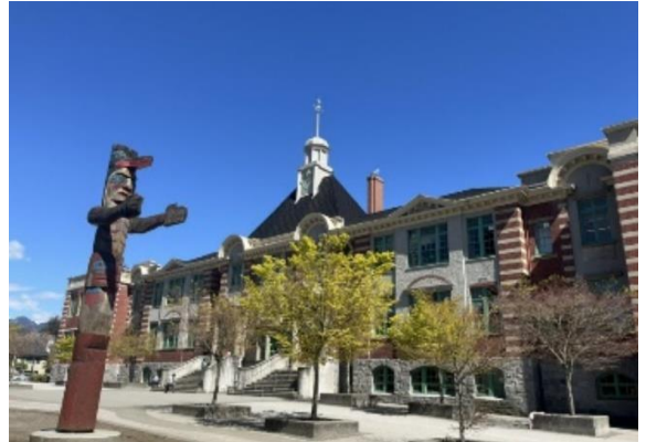
Welcome Figure at Ridgeway

We respectfully acknowledge that we live, work, play and learn on the traditional and unceded territories of the Skwxwú7mesh (Squamish) and Tsleil-Waututh Nations. Ridgeway Elementary is committed to reconciliation with these Nations, who have lived on these lands since time immemorial.