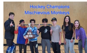
Students celebrate a win during our staff led lunch time Intramural league!

At Ridgeway, we strive to provide a safe, welcoming, and inclusive environment for all, fostering the development of unique individuals rooted in community, connection, and story.