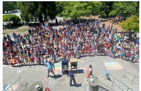
Everyone is welcome! Ridgeway Ravens celebrate inclusion with our annual Rainbow Dance party.

representatives, four teachers, two administrators, and one educational assistant, ensuring that our community is represented. This diverse group brings multiple perspectives to the table, reflecting the varied needs and interests of our school community.