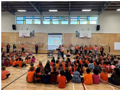
As a Downie Wenjack Legacy School , we are committed to reconciliation and fostering understanding of Indigenous history and culture.

We believe in fostering positive student behavior through our Ridgeway Code of Conduct and ROCKS program, which emphasizes Respect, Ownership, Cooperation, Kindness, and Safety. Additionally, we prioritize the home-school partnership to support students, maintaining open communication with families to support student success, including a weekly family newsletter and connection with our active Parent Advisory Council (PAC) .