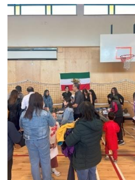
Families participating in our PAC led annual Multicultural Fair!

In addition, Ridgeway staff value working collaboratively through a variety of informal and formal structures, such as grade group teams, our case manager team, and Family of School and district networks. Our collective efforts also align with the Framework for Enhancing Student Learning, addressing intellectual, human and social, and career development, thereby meeting the diverse needs of our students and strengthening our community as a whole.