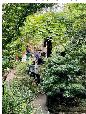
Families enjoying our Refuge Garden at our Welcome Back Open House!

Our school plan and priorities align closely with the North Vancouver School District's strategic plan. With our focus on specific areas for student growth we can prioritize student-centered education and innovative instruction . Our commitment to an inclusive culture and mental health is reflected in initiatives like our annual multicultural fair hosted with PAC, our Newcomer Tea, our many staff sponsored student clubs and opportunities, and our focus on positive behaviour. Our work as a Downie Wenjack Legacy School reflects our commitment to Truth, Healing, and Reconciliation . We support environmental stewardship through our focus on litterless lunches and ownership for our Refuge Garden.