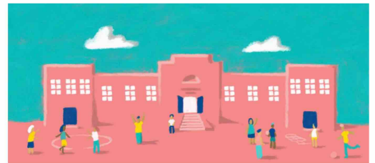
The NVSD Back-to-School Plan: September 2020 (APPROVED)

Also included for your reference and interest is a link to the - Superintendent's report