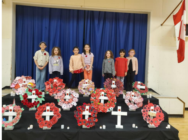
7 - Student Presenters