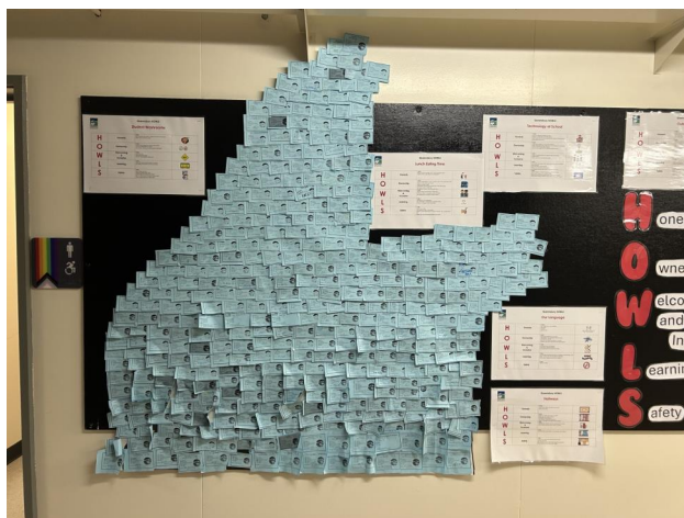
4 - A wall full of HOWLS