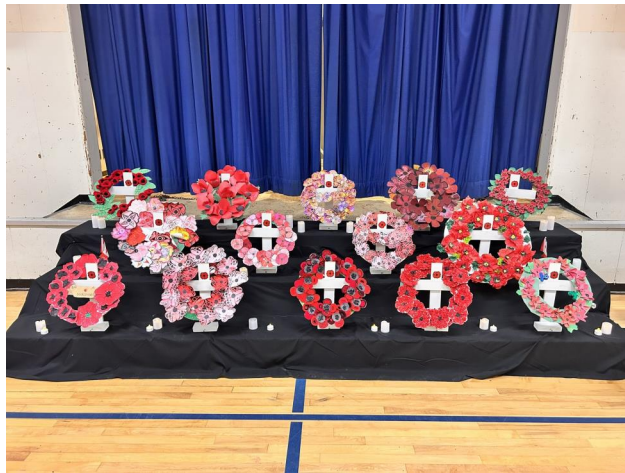
5 - Remembrance Day Wreaths made by each Division