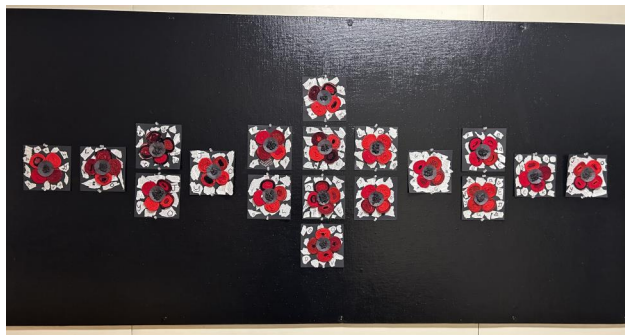
2 - Hallway art