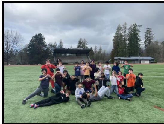
For Heart & Stroke month, students of Division 4 participated in a 3km or 5km run at Mahon Park.