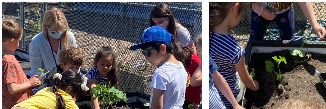
Kindergarten students planted bean plants they started from seed in their classroom.

Gardening provides kids an opportunity to get dirty and do some great learning along the way! In our garden boxes you'll start to see what students have planted, and they'll get to enjoy learning how to care for what they plant, and will likely come to understand that not all plants will survive and thrive. Our hope is that by learning about plant care, sharing plants with the animals around us, and food plant harvesting, students will learn that their actions as gardeners and plant stewards can benefit people, animals and the land we live on.