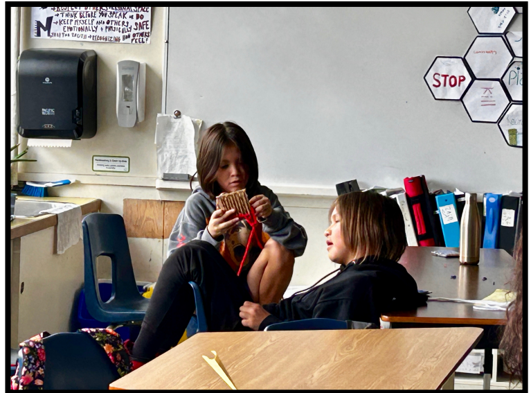
Students have learned about gifting protocols as well as developed skill at weaving, beading, sewing deer hide, crafting with cedar, and visual arts as they have helped prepare for Potlatch.