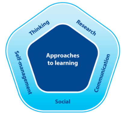
Figure ATL01 The five interrelated approaches to learning

This week the parents at the Monday Mingle learned about the IB Approaches to Learning (ATLs). These skills empower critical abilities like research, communication, and self-management. They foster independent and reflective learning, preparing students for academic success and lifelong skills. We explored how parents can support the development of these skills at home which will enhance children's overall academic growth and ability to navigate various challenges in and beyond the classroom.