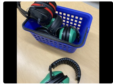
Noise cancelling headphones