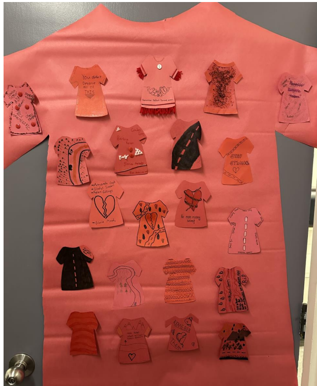
4 - Artwork from Division F03 (Mme. Stachowiak)