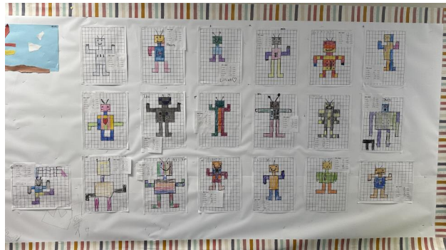
4 - Artwork from Division F10 (Mme. Whelan)