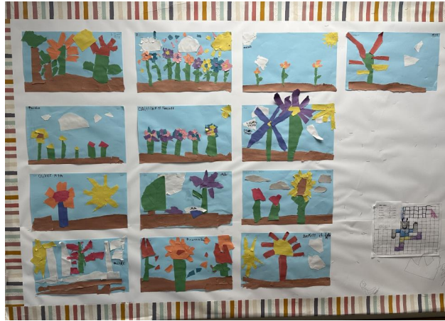
3 - Artwork from Division F10 (Mme. Whelan)