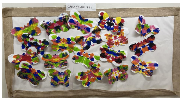
4 - Artwork from Division F12 (Mme. Swain)