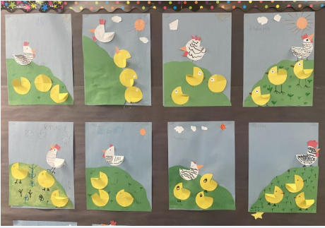
Division E09 Kam/Boutin