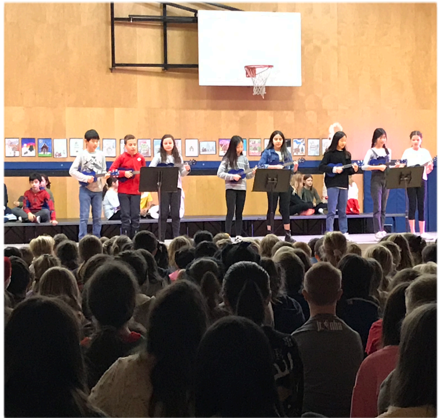
Here are some of the performers from our Intermediate Winter Concert on December 12.