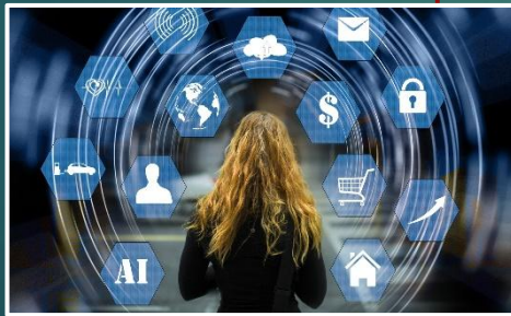
ADST & Skilled Trades