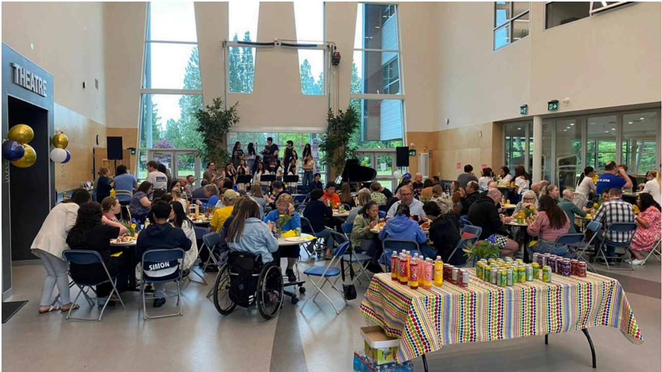
Photo from 2024-25 Staff Appreciation Lunch